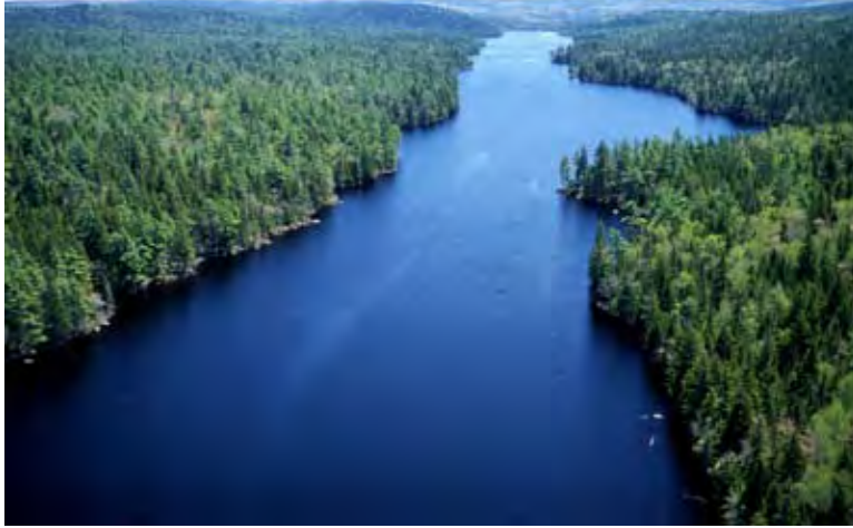
Ship Harbour Long Lake

In the November 22, 2007 Speech from the Throne, the Province announced its intention to establish a large new wilderness area on Crown lands near Ship Harbour Long Lake in Halifax County.