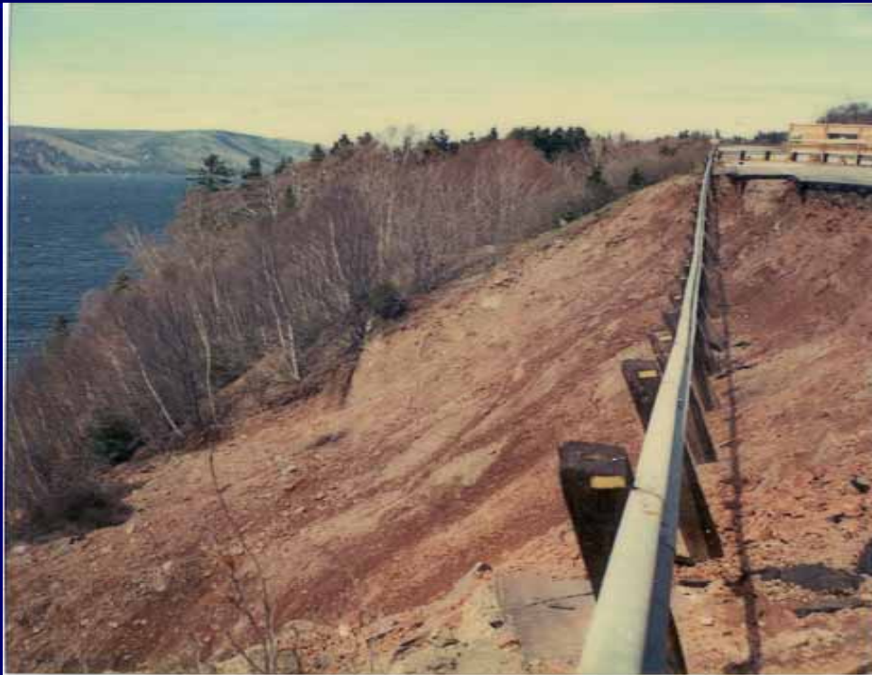
Highway 105, South Haven Victoria County 19 May 82