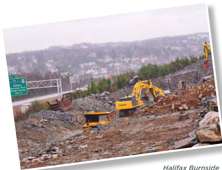
Halifax Burnside Sewer work