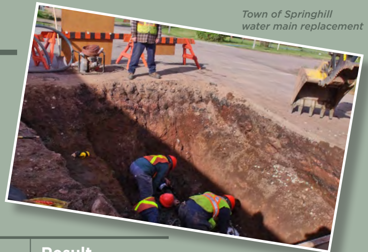
Town of Springhill water main replacement

https://surveys.gov.ns.ca/TakeSurvey.aspx?SurveyID=942JIn8