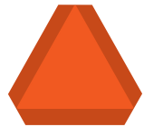
Slow-moving Vehicle Sign

You must display a slow-moving-vehicle sign at the rear of a farm tractor, or the load hauled by the tractor, and any other vehicle that cannot maintain a speed over 40 km/h under normal conditions. When you see this sign, reduce your speed.