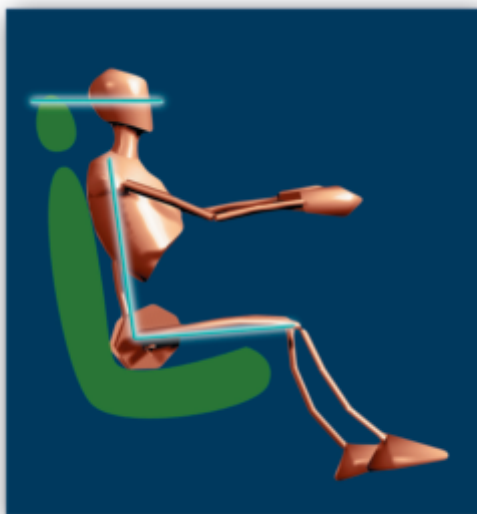
Sit Up Straight