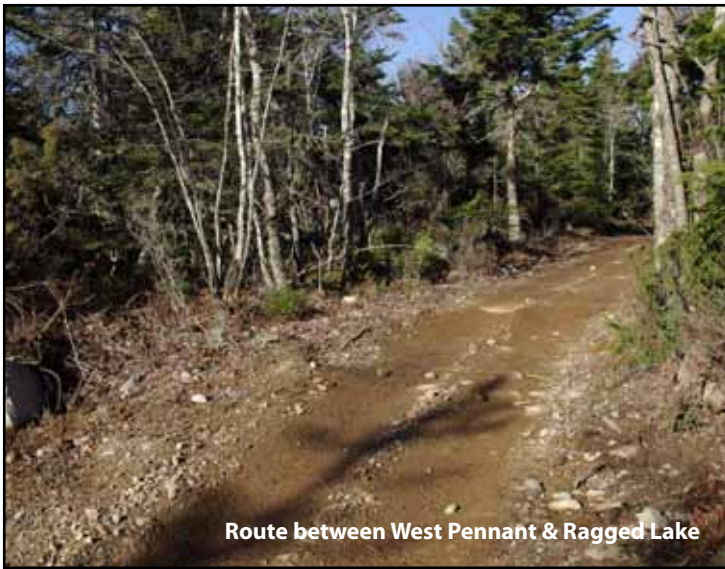
Route between West Pennant & Ragged Lake

To help protect the environment, the Wilderness Areas Protection Act (the Act) generally prohibits vehicle use, but, vehicle use can be authorized in specific circumstances.