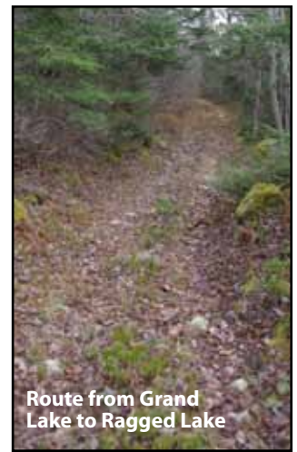
Route from Grand Lake to Ragged Lake

Nova Scotia Environment intends to work with others to develop a management plan for Terence Bay Wilderness Area when, and as, resources permit.