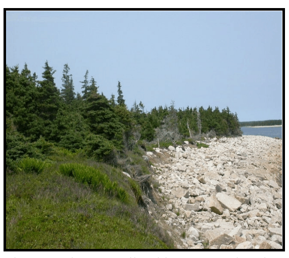
Photograph 3 Headland barrens and rocky shoreline

toothed cinquefoil ( Potentilla tridentata* ), sandwort ( Arenaria lateriflora* ), seasideangelica ( Angelica lucida* ), the sedge Carex trisperma* and common hair grass ( Deschampsia flexuosa* ). None of the plant species encountered is rare or threatened within the province. The most interesting plant assemblage was an extensive community on the headland, unexpectedly dominated by cinnamon fern (Photograph 4)