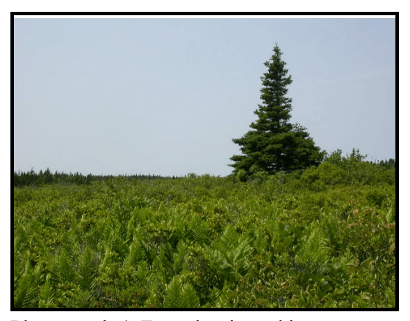
Photograph 4 Fern-dominated barrens community near the coast