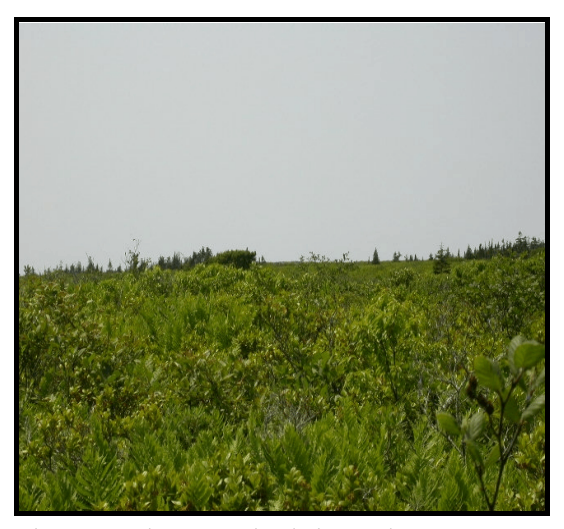
Photograph 2 Typical dense barrens vegetation

The barrens vegetation was dominated by ericaceous shrubs, especially huckleberries (Gaylussacia baccata* and G. dumosa*), velvet-leaf blueberry (Vaccinium myrtilloides*), Labrador-tea (Ledum groenlandicum), sheep laurel (Kalmia angustifolia), bog-rosemary (Andromeda glaucophylla) and leather-leaf (Cassandra calyculata). Cinnamon fern (Osmunda cinnamonia), bracken (Pteridium aquilinum), alders (Alnus incana and A. viridis), black crowberry (Empetrum nigrum), teaberry (Gaultheria procumbens) and mountain-ash were also present. On the coastal headlands the barrens