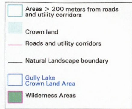
Map 3. Fragmentation Analysis: Areas of Land > 200 meters from roads and utility corridors in Selected Landscapes in North-central Nova Scotia.