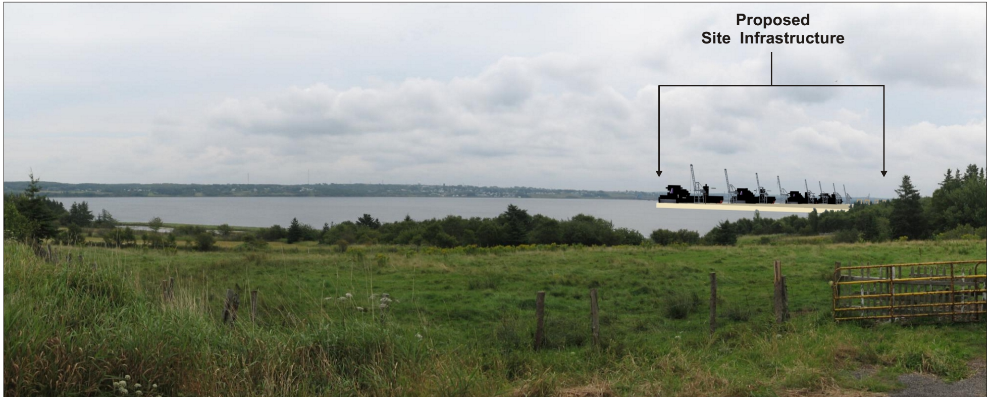
Figure I-5 View looking Southeast from a road off the Point Edward Highway (Viewpoint 2)