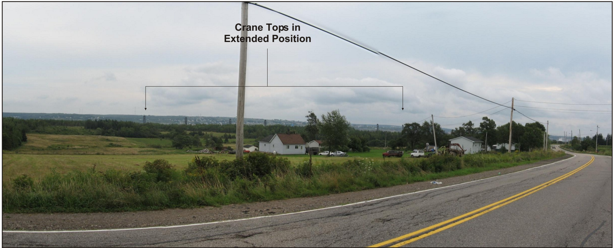
Figure I-7 View looking East from the Point Edward Highway, Edwardsville (Viewpoint 7)