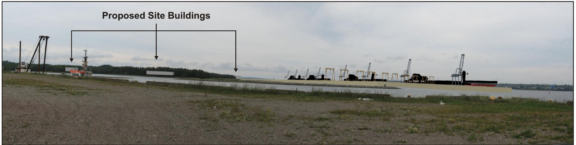
Figure I-8 View looking North from the Edwardsville Dockyard (Viewpoint 10)