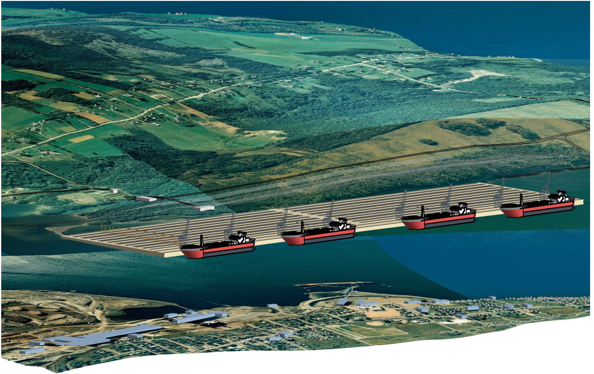
Figure I-2 3D Rendering of Proposed SYDPORT Infrastructure, East to West View