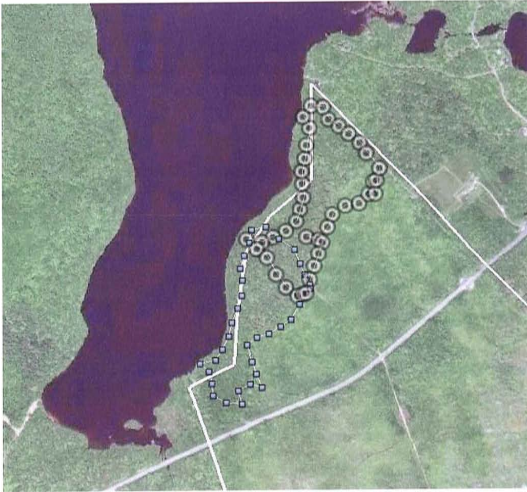
Figure 1. Area search routes at North Canoe Lake. Squares represent track surveyed on 20 June 2011, while circles represent track surveyed on 6 July 2011.