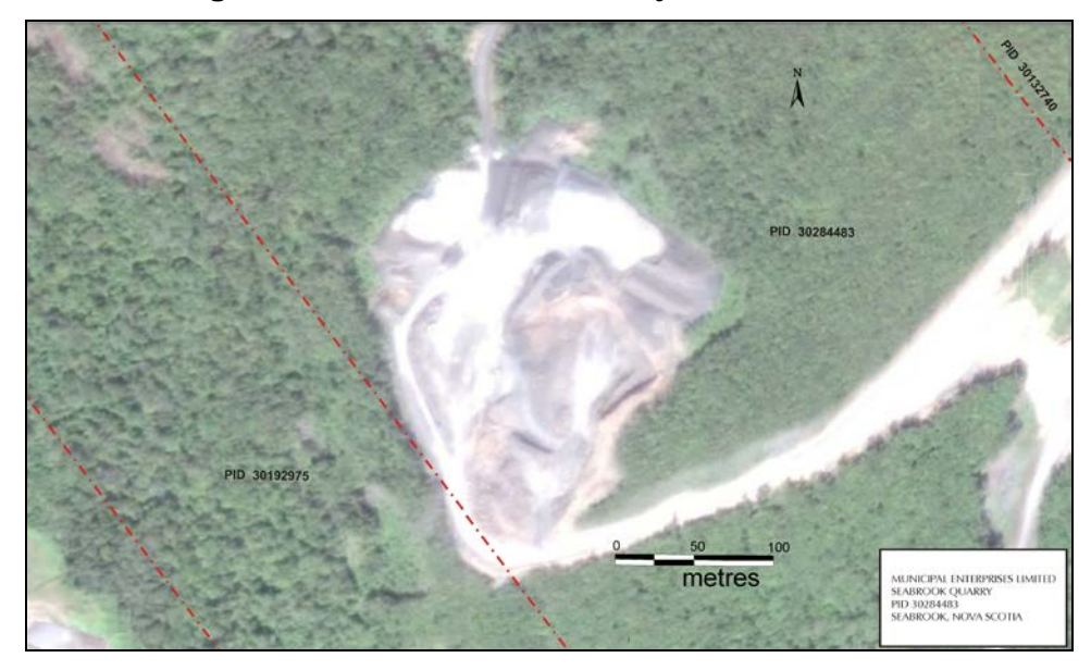
Figure 2 – Site Location and Adjacent Land Uses