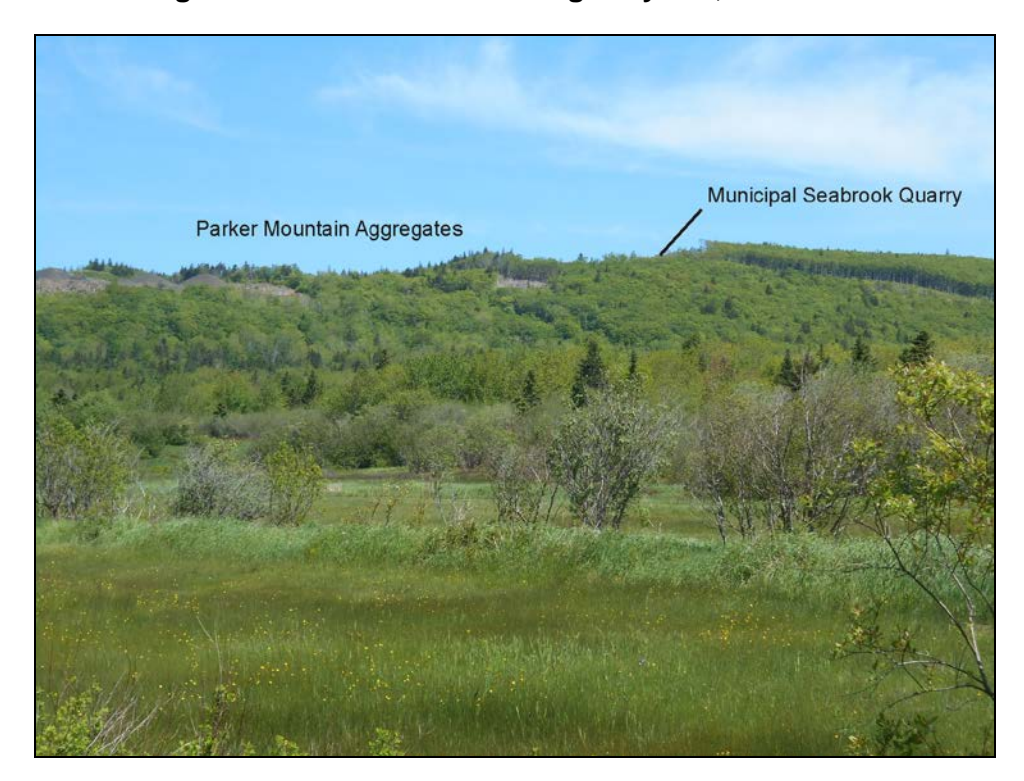
Figure 3 – View of site from Highway 217, June 2015.

Seabrook Quarry and the access road, and associated exposed bedrock and slopes are visible from Highway 217 (Figure 3) and can also be seen from as far away as Highway 101 near Cornwallis. The expanded quarry in late stages of development is not expected to be more be visible from these locations than at present. The adjacent Parker Mountain Aggregates Quarry site is presently, and will continue to be, visible from a distance (Figure 3). Both quarries are approximately 1.2 kilometers from Highway 217.