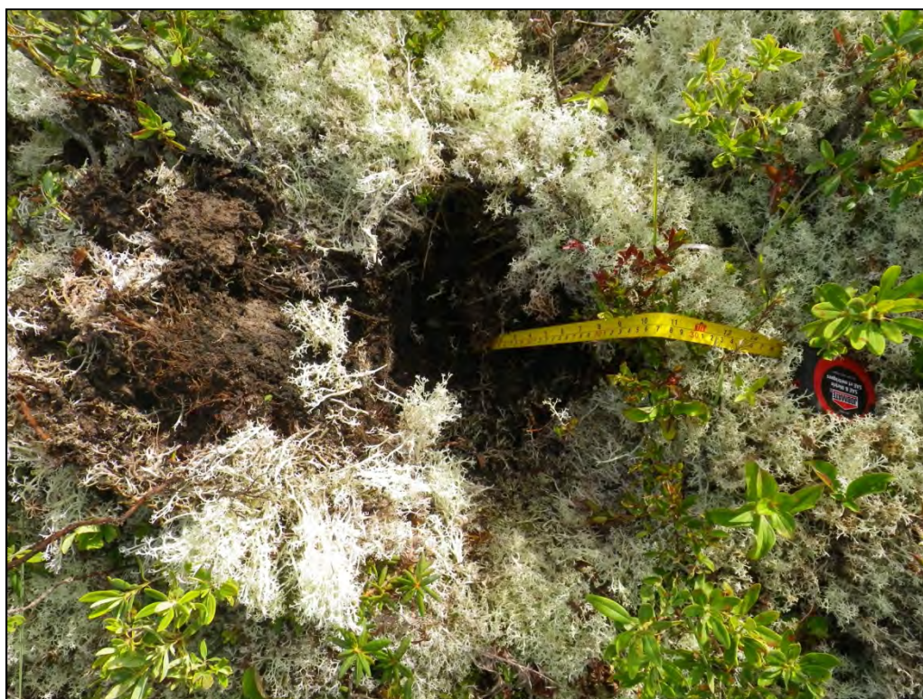
Photograph 4: Wetland 1 (WL1) – Upland Test Pit