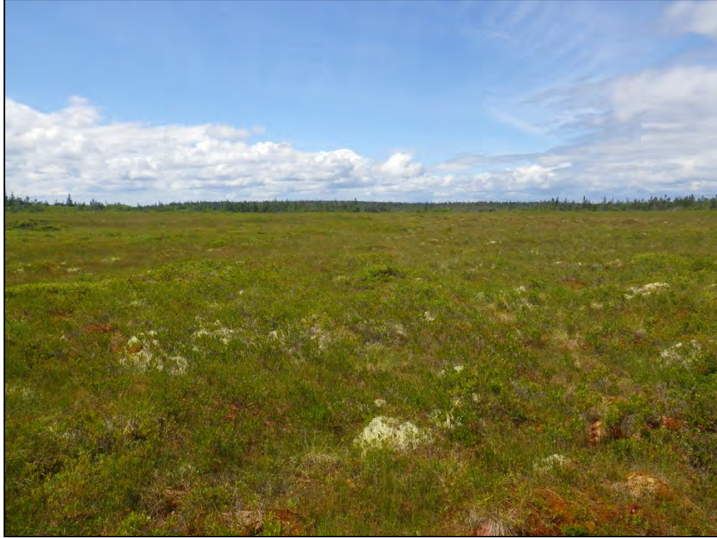
Photograph 41: Wetland 11 (WL11) – Wetland Habitat