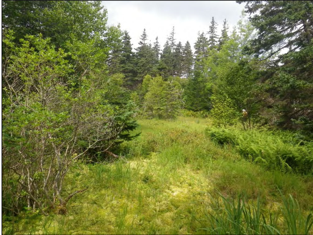
Photograph 86: Wetland 22 (WL22) – Wetland Habitat