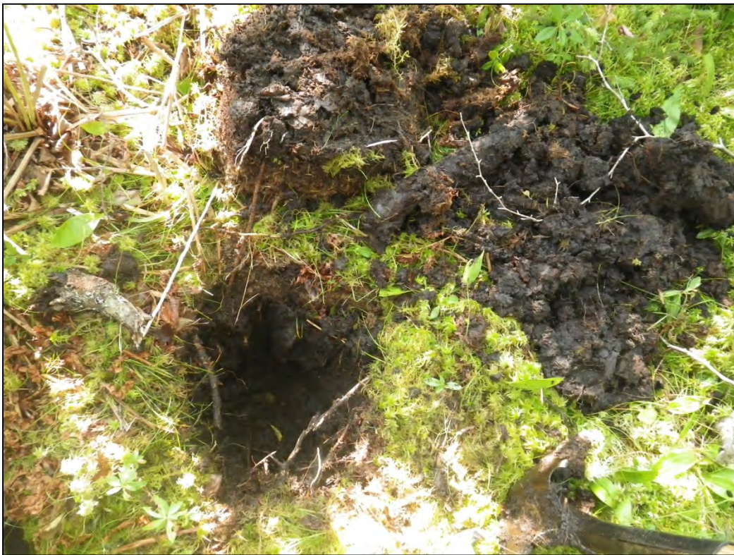
Photograph 51: Wetland 13 (WL13) – Wetland Test Pit