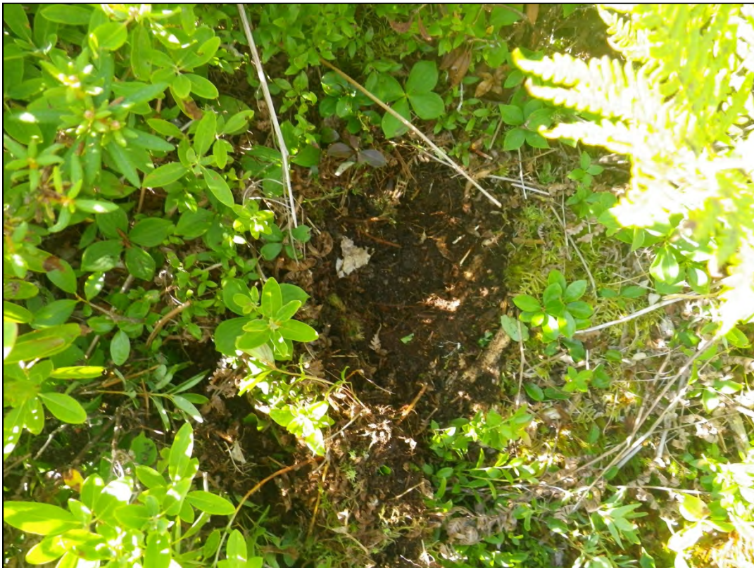
Photograph 61: Wetland 15 (WL15) – Upland Test Pit