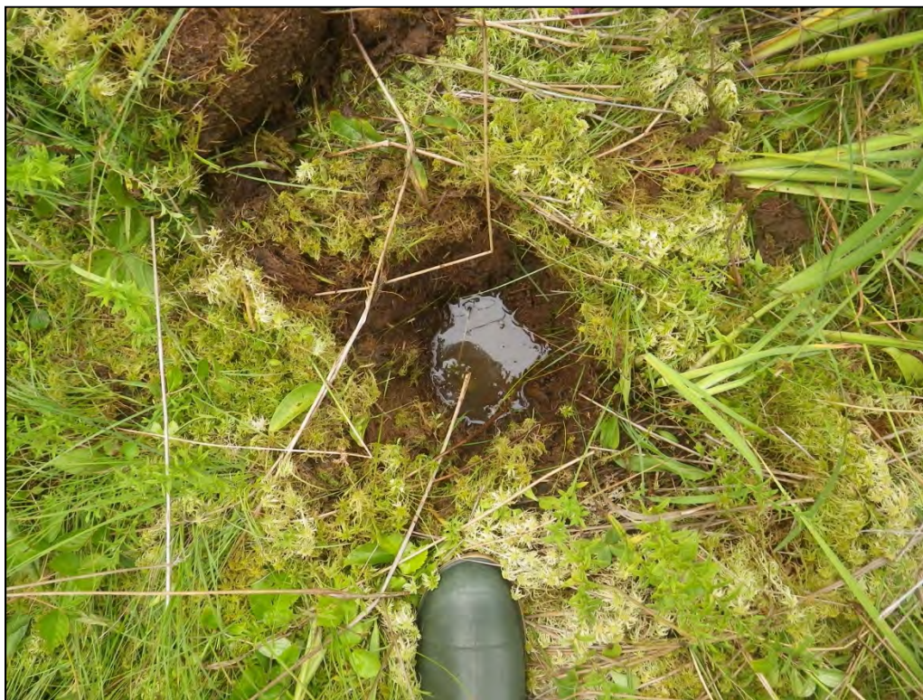
Photograph 10: Wetland 3 (WL3) – Wetland Test Pit