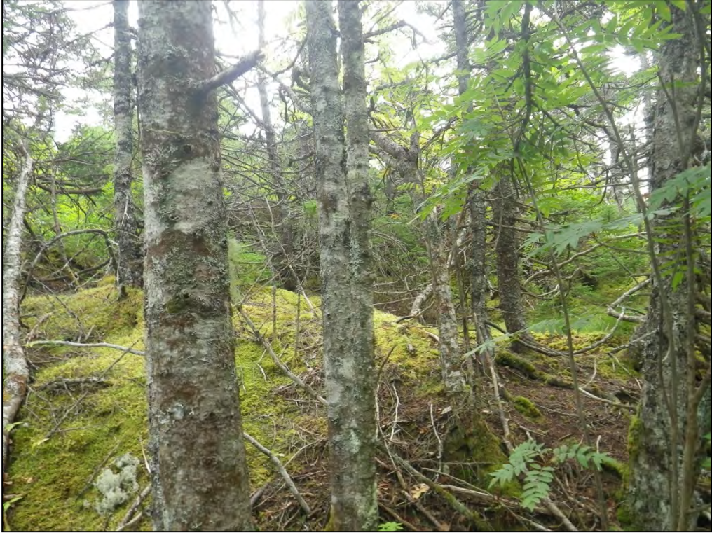
Photograph 39: Wetland 10 (WL10) – Upland Habitat