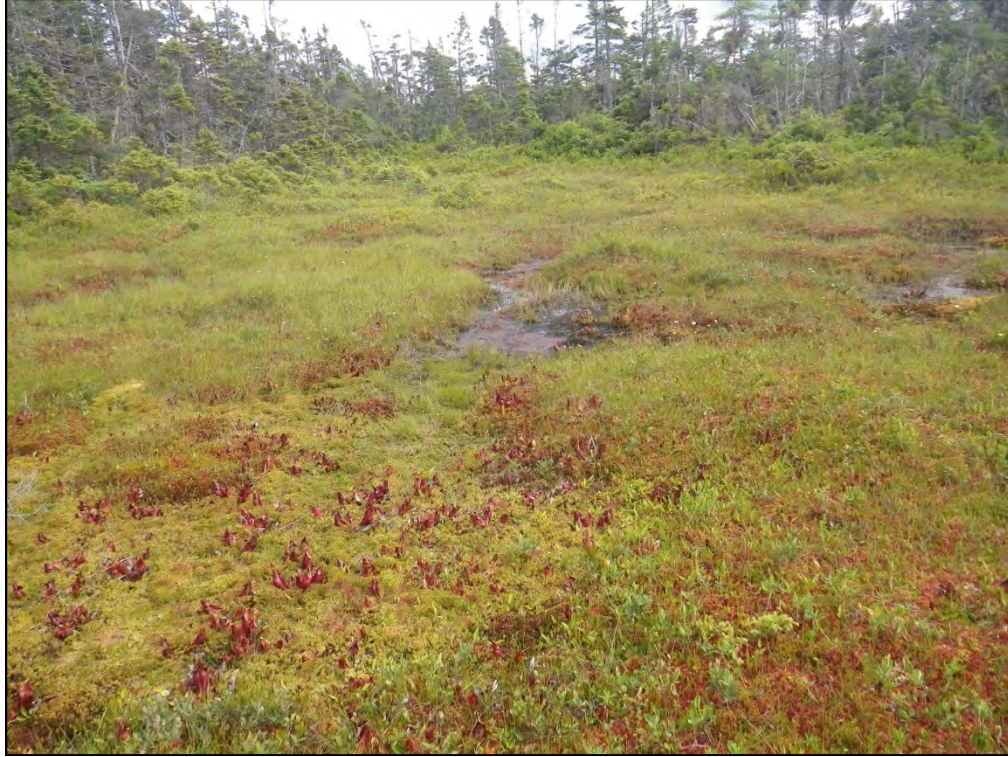
Photograph 62: Wetland 16 (WL16) – Wetland Habitat