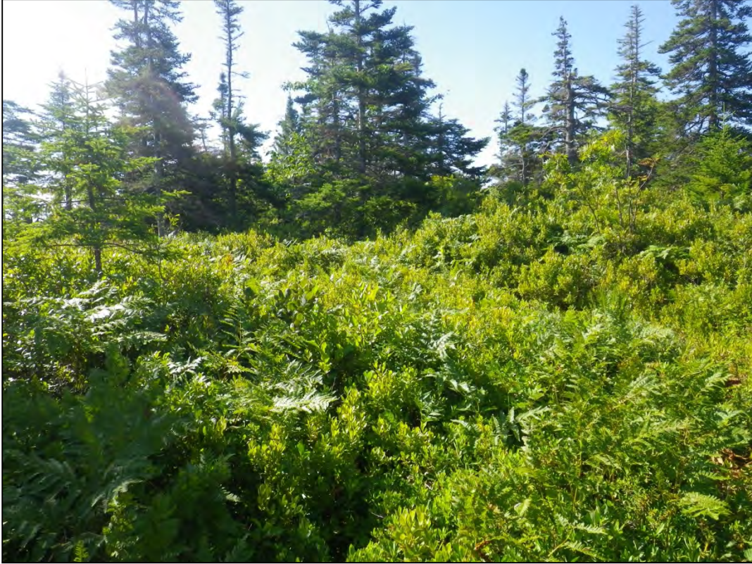
Photograph 60: Wetland 15 (WL15) – Upland Habitat