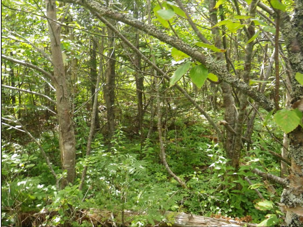
Photograph 7: Wetland 2 (WL2) – Upland Habitat