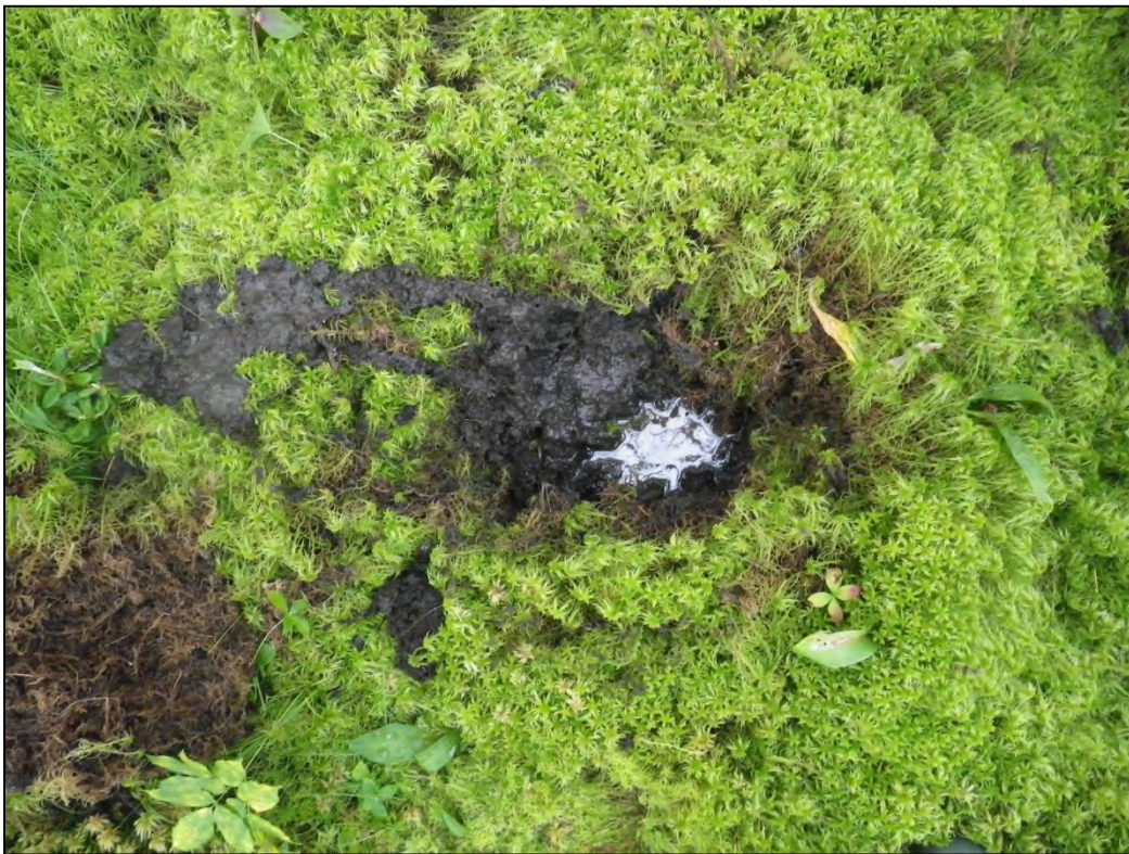
Photograph 71: Wetland 18 (WL18) – Wetland Test Pit