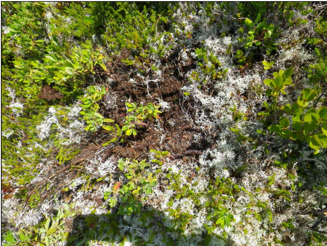
Photograph 77: Wetland 19 (WL19) – Upland Test Pit