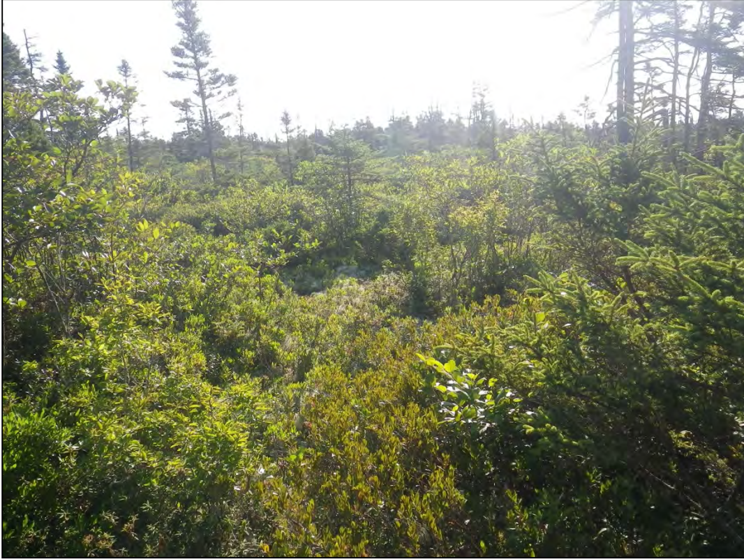
Photograph 52: Wetland 13 (WL13) – Upland Habitat