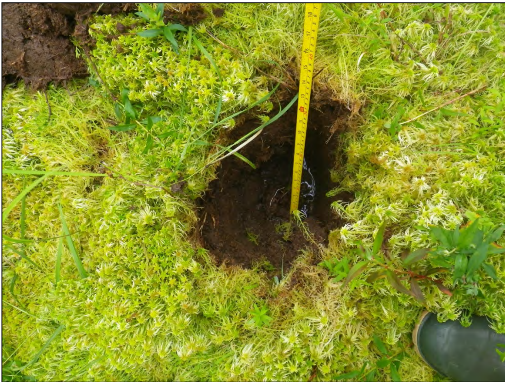
Photograph 87: Wetland 22 (WL22) – Wetland Test Pit