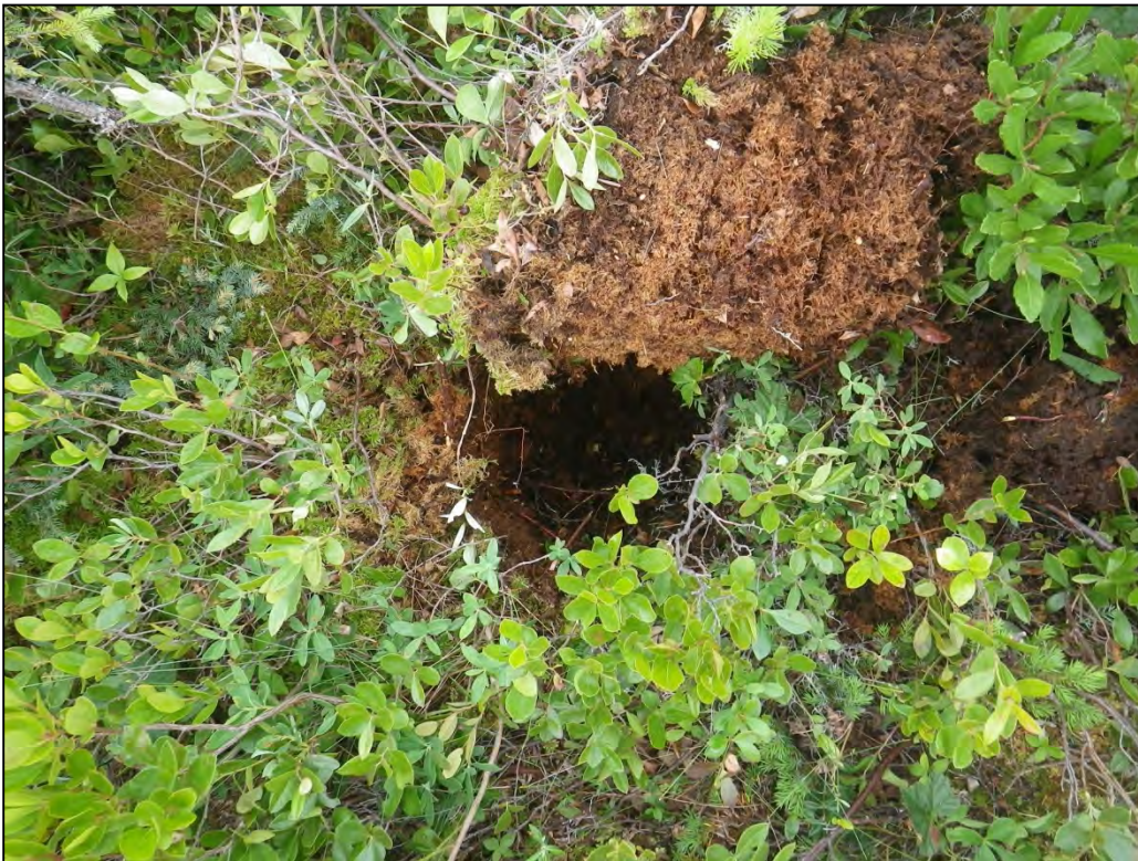
Photograph 34: Wetland 9 (WL9) – Wetland Test Pit