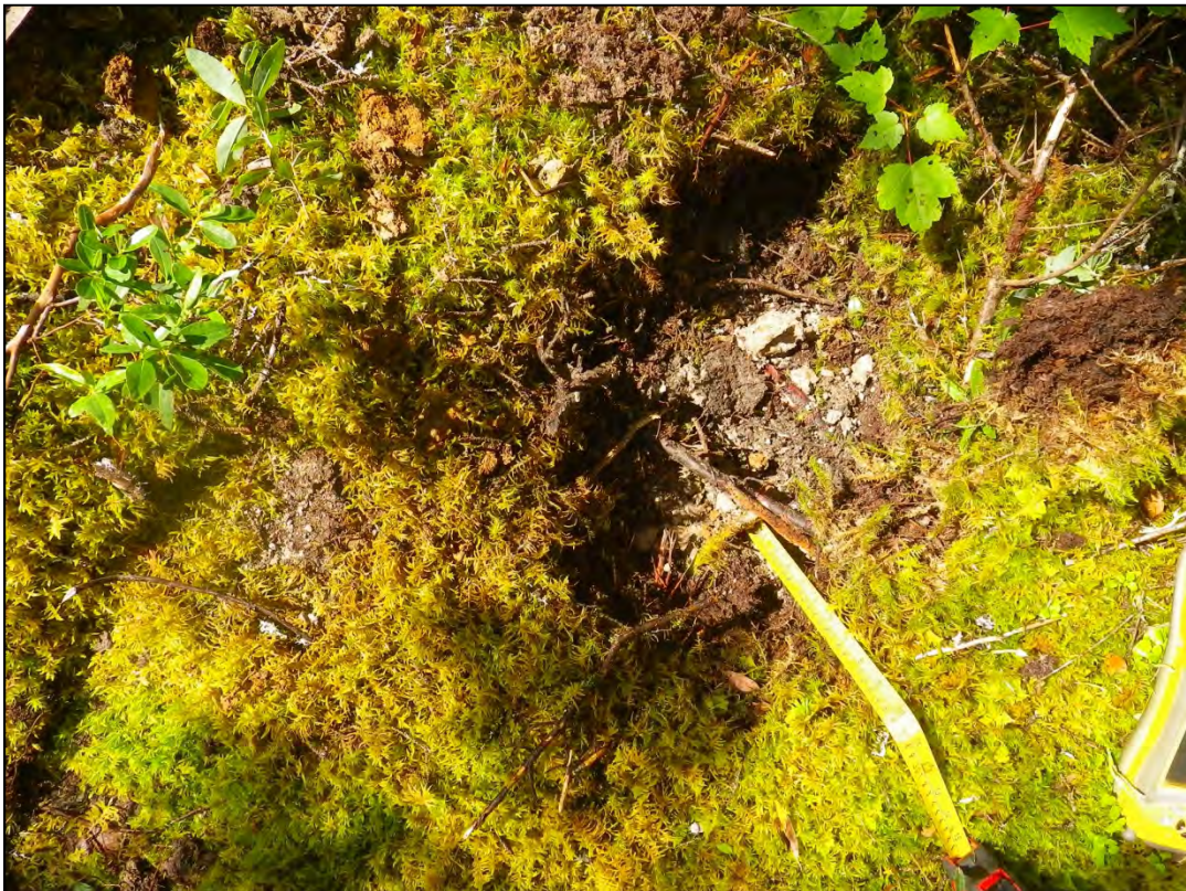
Photograph 69: Wetland 17 (WL17) – Upland Test Pit