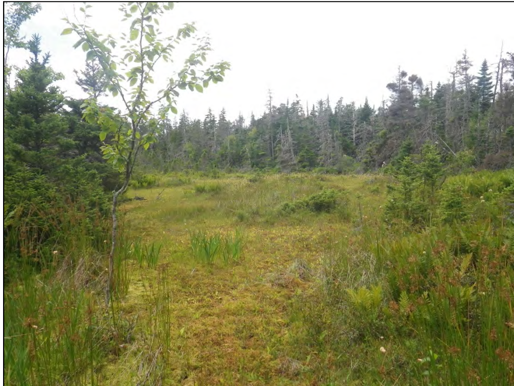
Photograph 9: Wetland 3 (WL3) – Wetland Habitat