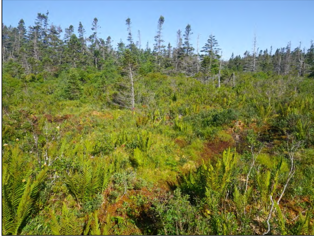
Photograph 46: Wetland 12 (WL12) – Wetland Habitat