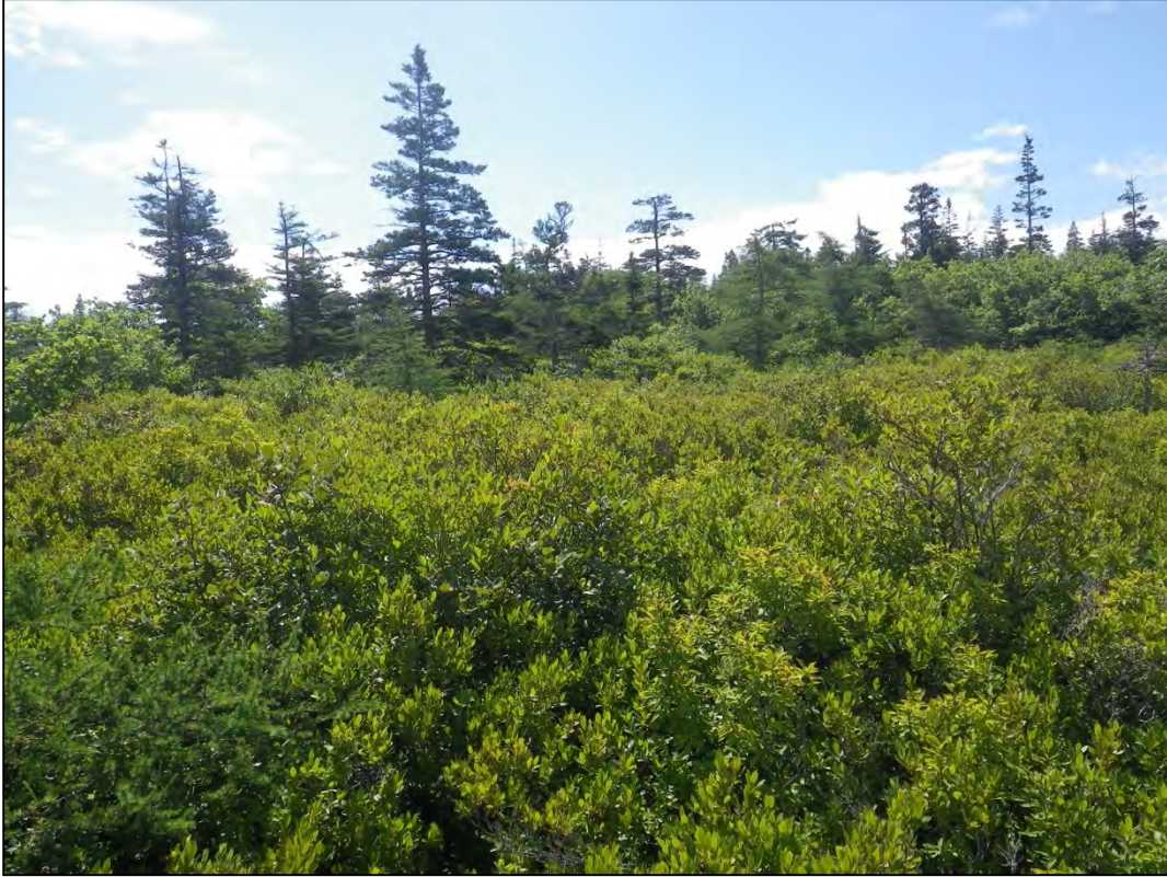
Photograph 44: Wetland 11 (WL11) – Upland Habitat