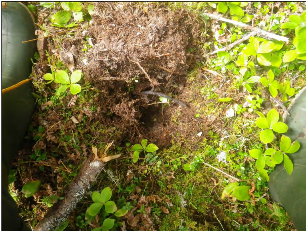
Photograph 28: Wetland 7 (WL7) – Upland Test Pit