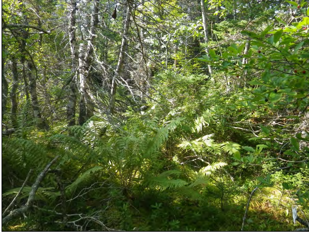
Photograph 50: Wetland 13 (WL13) – Wetland Habitat