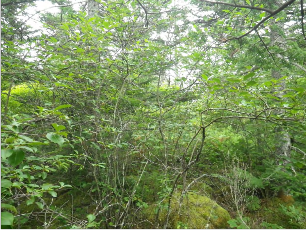
Photograph 31: Wetland 8 (WL8) – Upland Habitat