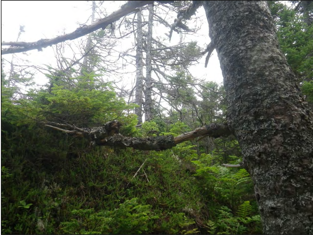
Photograph 27: Wetland 7 (WL7) – Upland Habitat