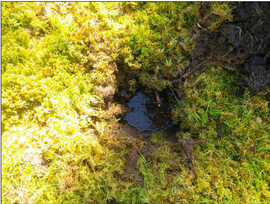
Photograph 59: Wetland 15 (WL15) – Wetland Test Pit