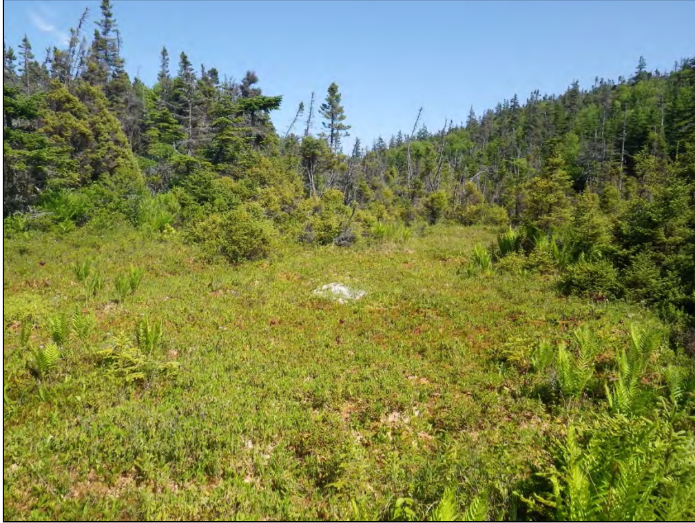
Photograph 21: Wetland 6 (WL6) – Wetland Habitat