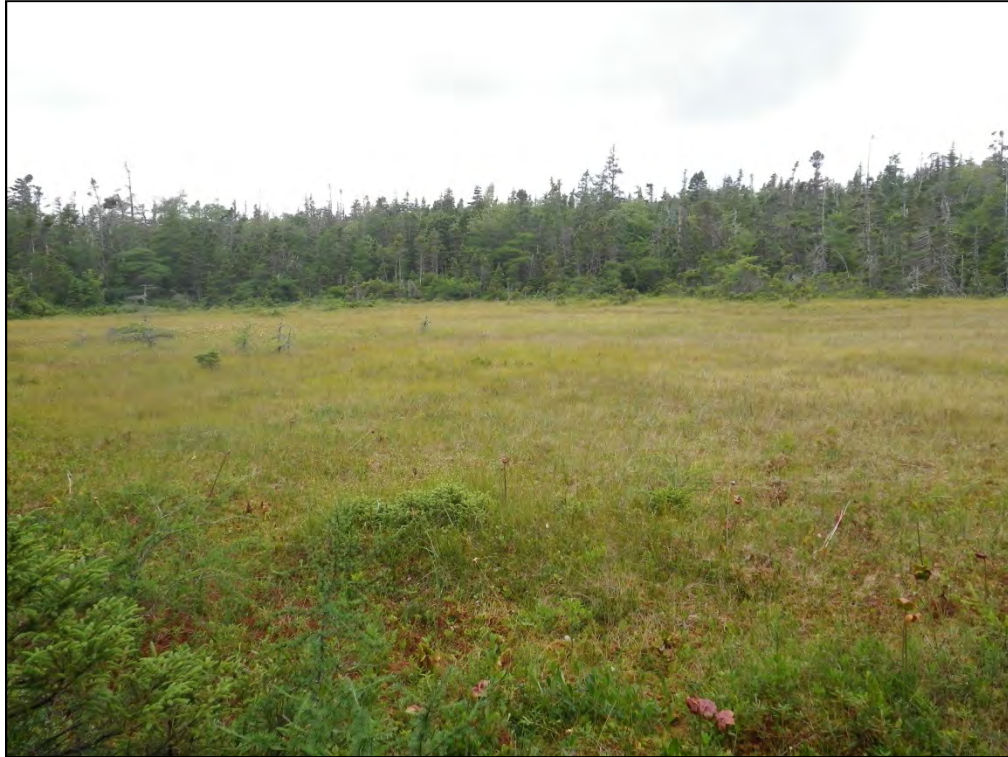
Photograph 66: Wetland 17 (WL17) – Wetland Habitat