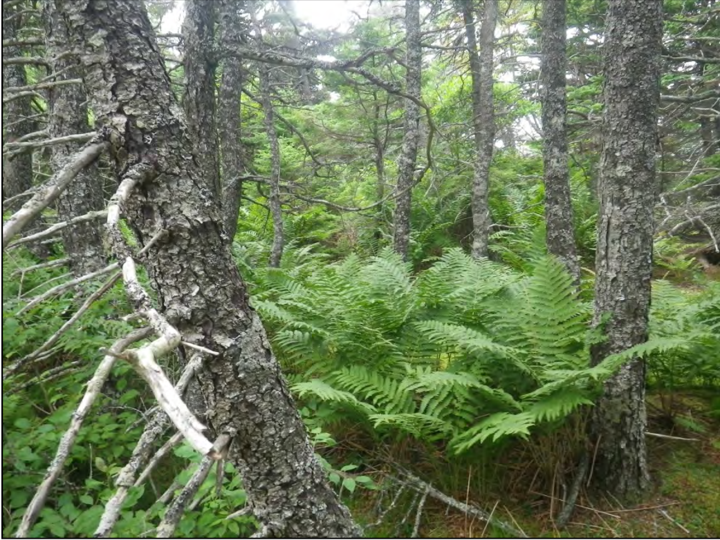
Photograph 25: Wetland 7 (WL7) – Wetland Habitat