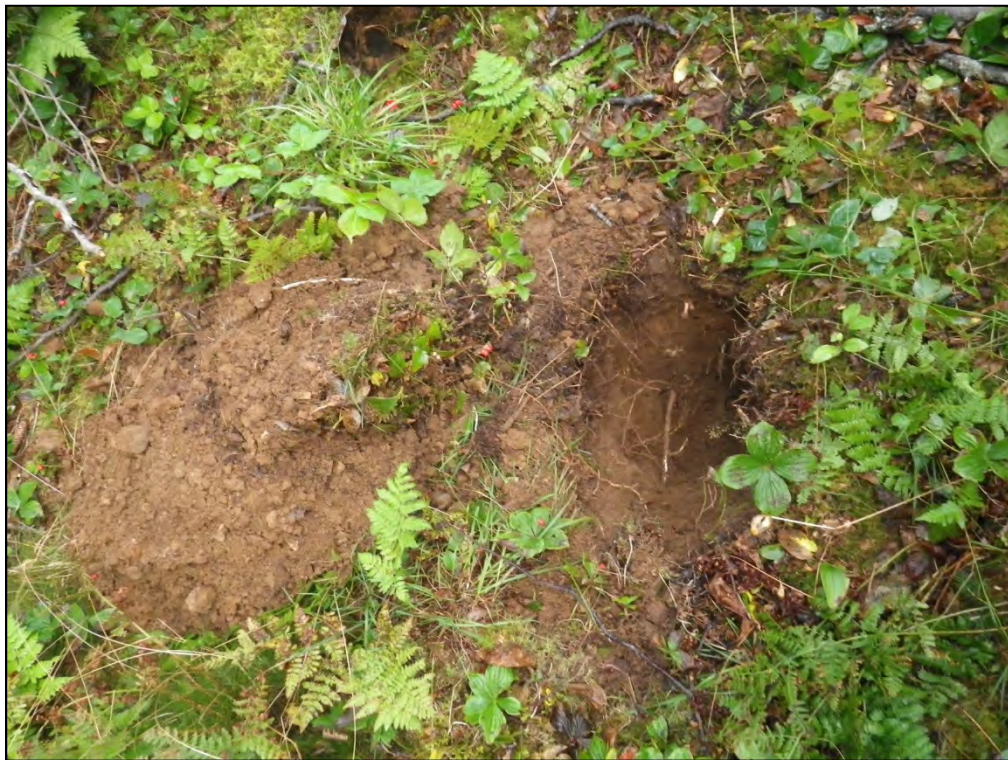
Photograph 20: Wetland 5 (WL5) – Upland Test Pit