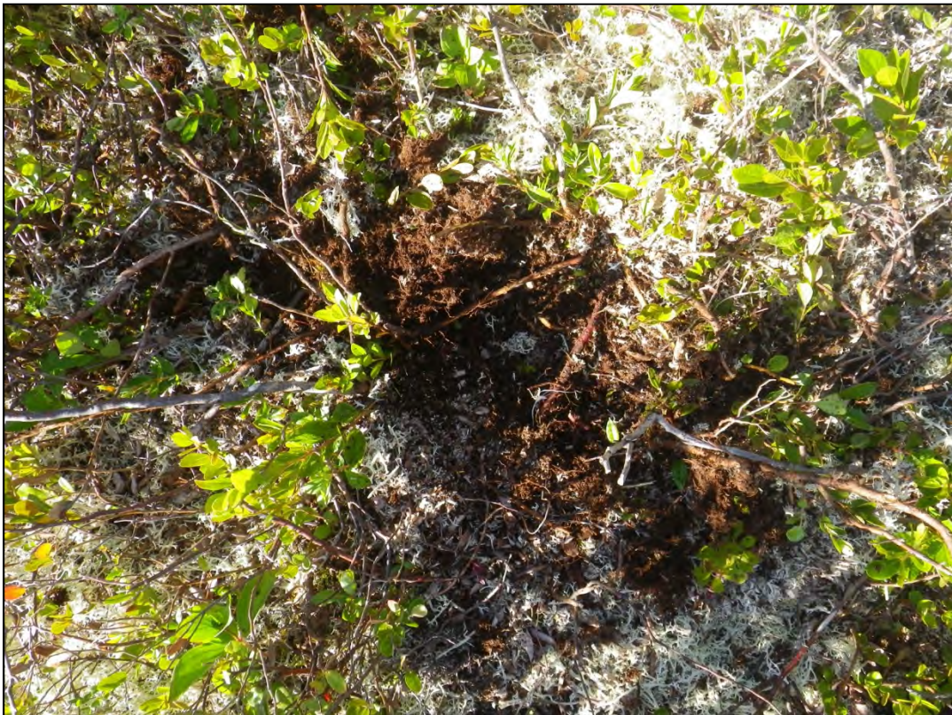
Photograph 49: Wetland 12 (WL12) – Upland Test Pit