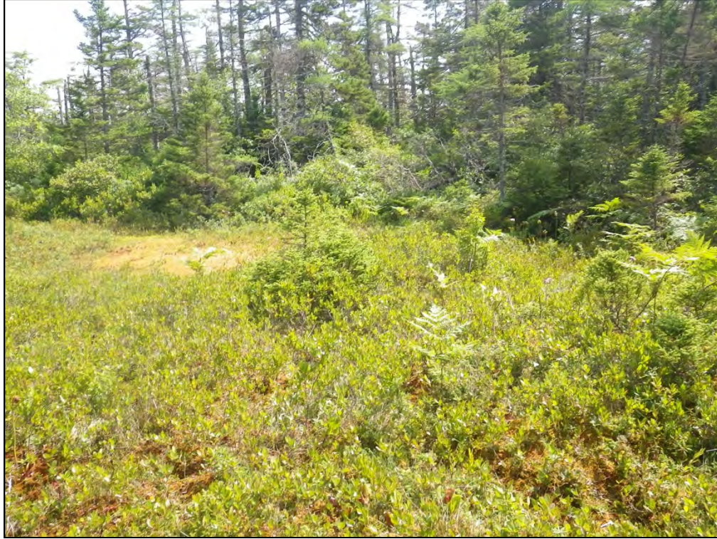
Photograph 70: Wetland 18 (WL18) – Wetland Habitat