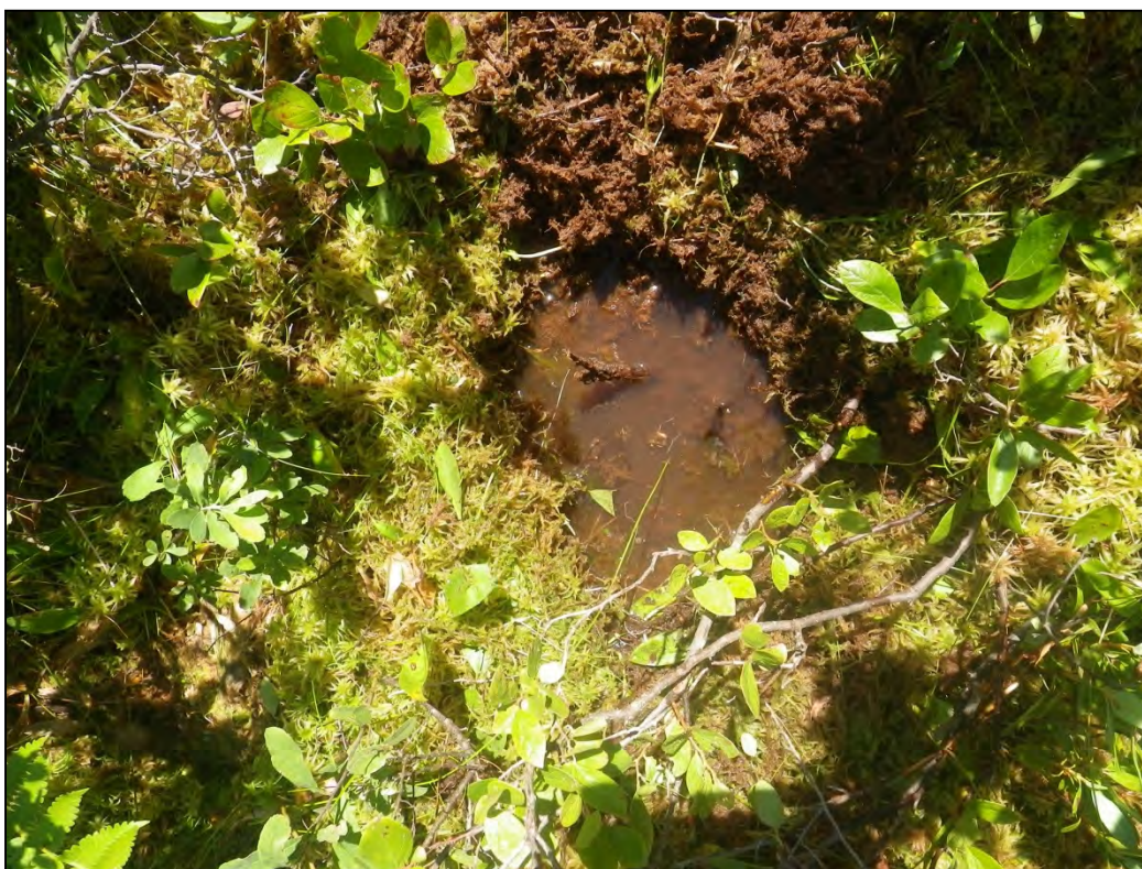
Photograph 55: Wetland 14 (WL14) – Wetland Test Pit