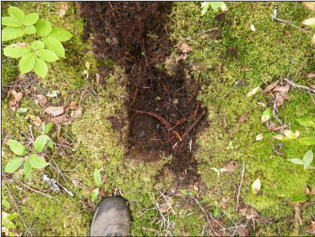
Photograph 40: Wetland 10 (WL10) – Upland Test Pit