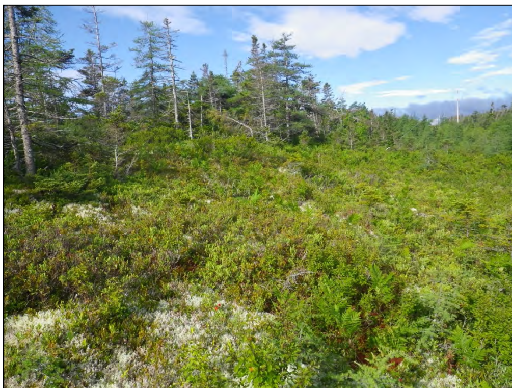
Photograph 3: Wetland 1 (WL1) – Upland Habitat