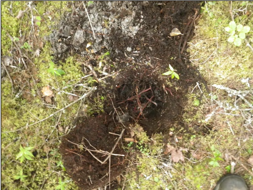
Photograph 32: Wetland 8 (WL8) – Upland Test Pit