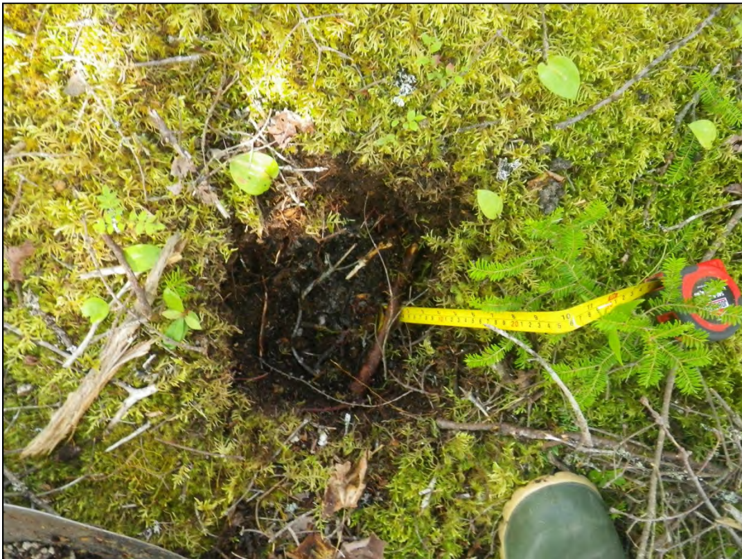
Photograph 65: Wetland 16 (WL16) – Upland Test Pit