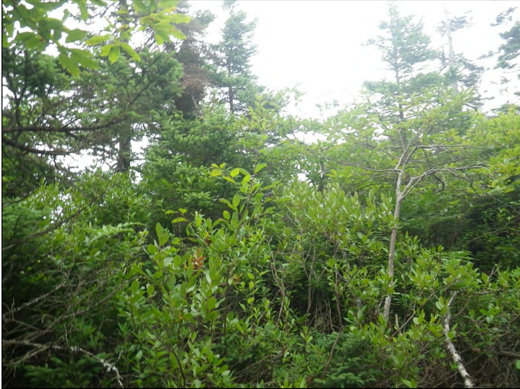
Photograph 35: Wetland 9 (WL9) – Upland Habitat