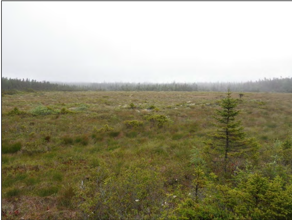
Photograph 1: Wetland 1 (WL1) - Wetland Habitat