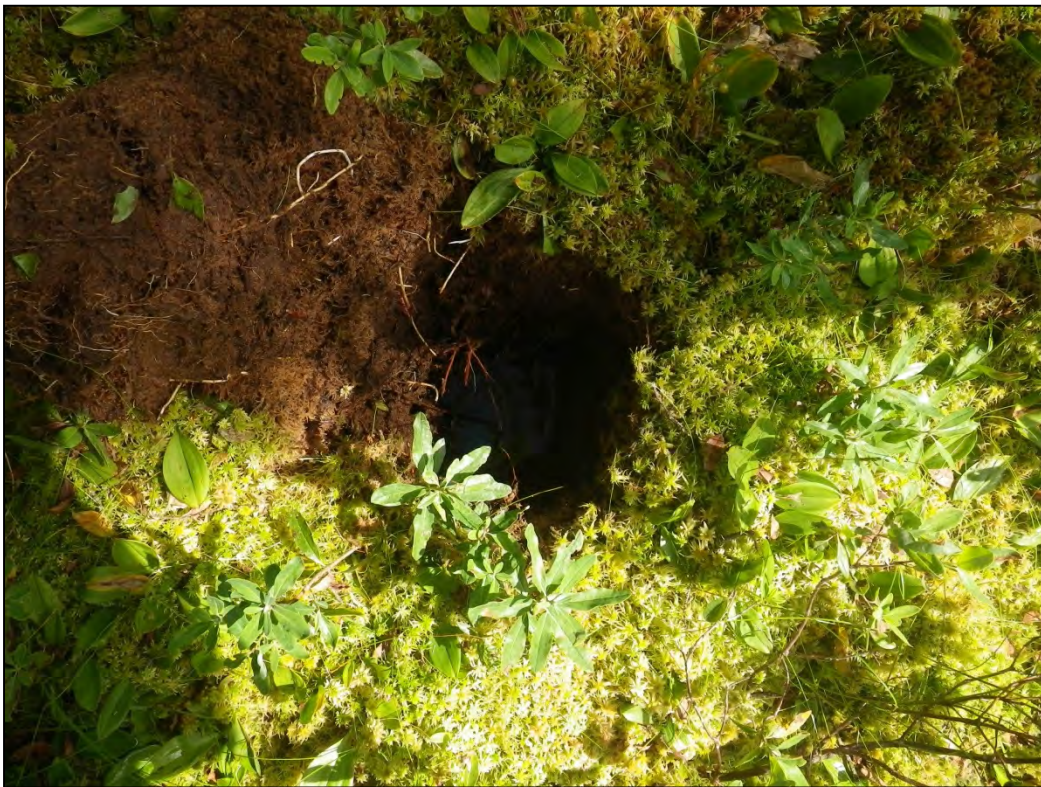
Photograph 63: Wetland 16 (WL16) – Wetland Test Pit