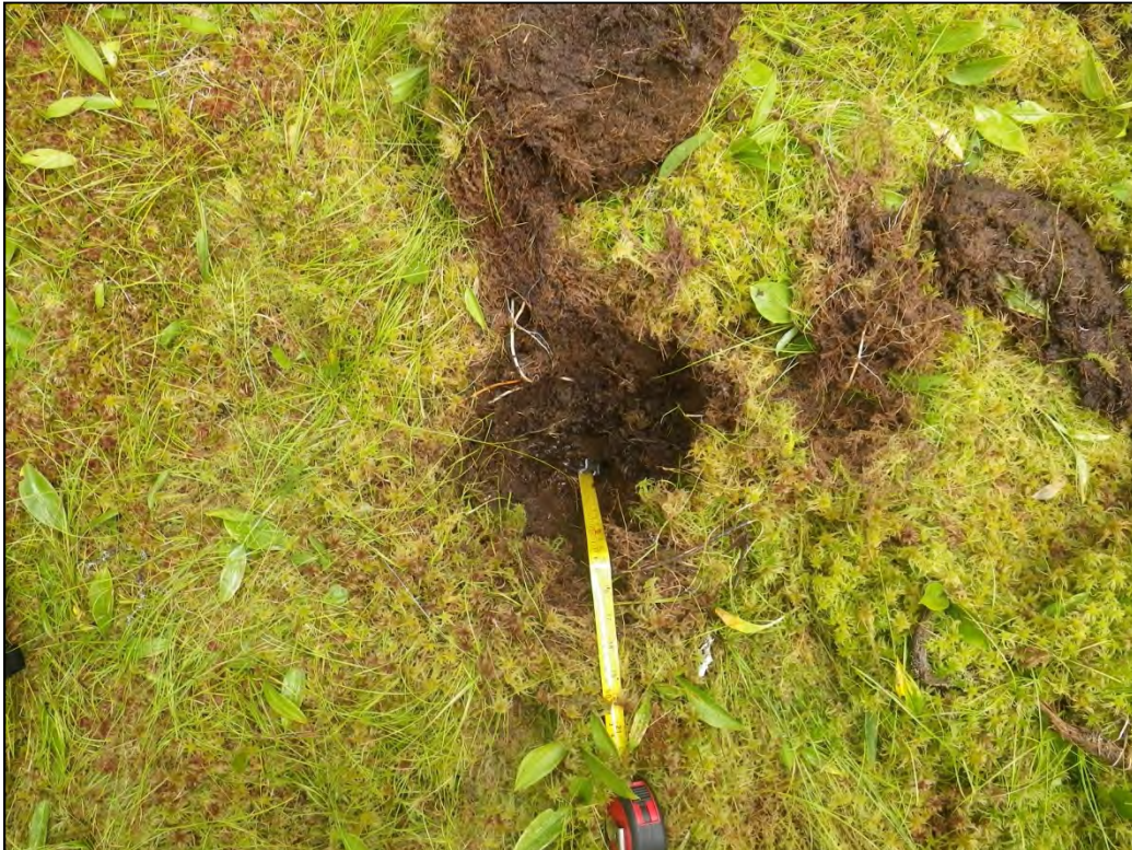
Photograph 14: Wetland 4 (WL4) – Wetland Test Pit