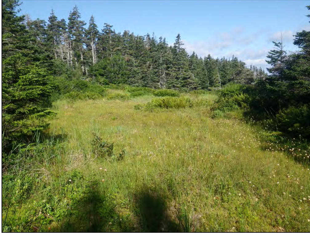
Photograph 82: Wetland 21 (WL21) – Wetland Habitat