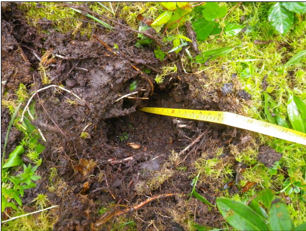
Photograph 67: Wetland 17 (WL17) – Wetland Test Pit