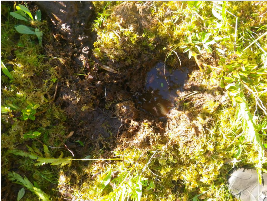
Photograph 47: Wetland 12 (WL12) – Wetland Test Pit