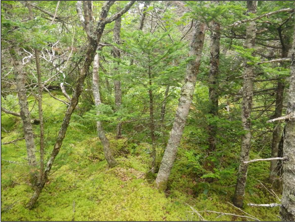
Photograph 37: Wetland 10 (WL10) – Wetland Habitat