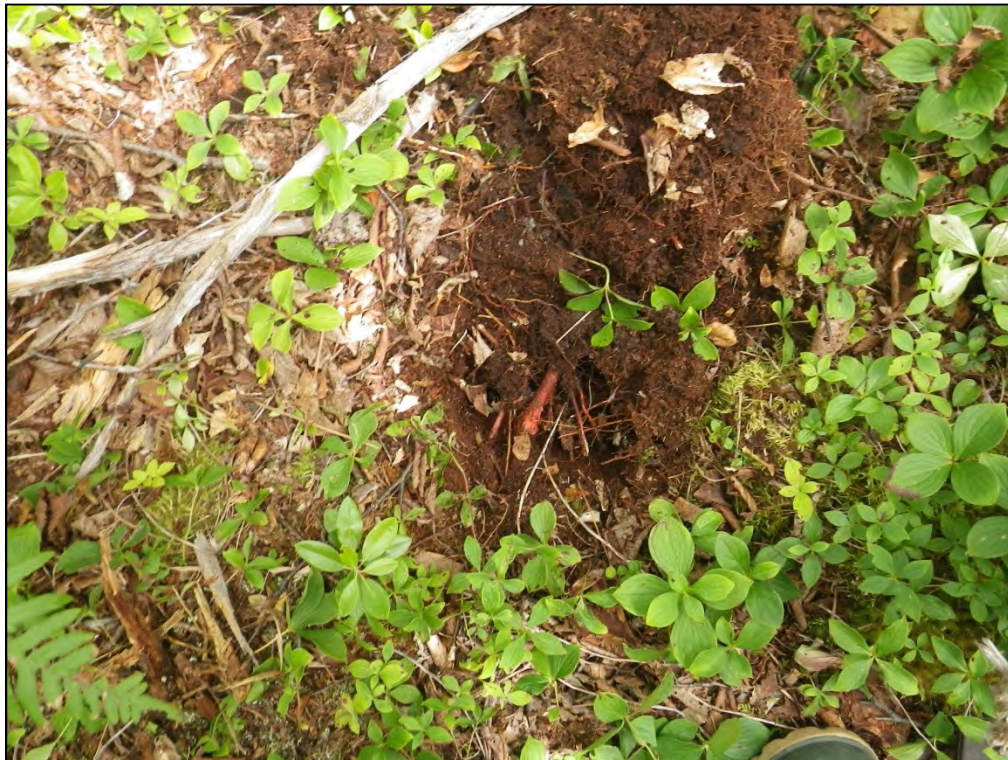
Photograph 8: Wetland 2 (WL2) – Upland Test Pit