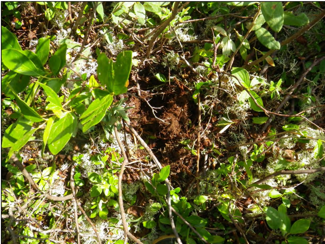
Photograph 81: Wetland 20 (WL20) – Upland Test Pit