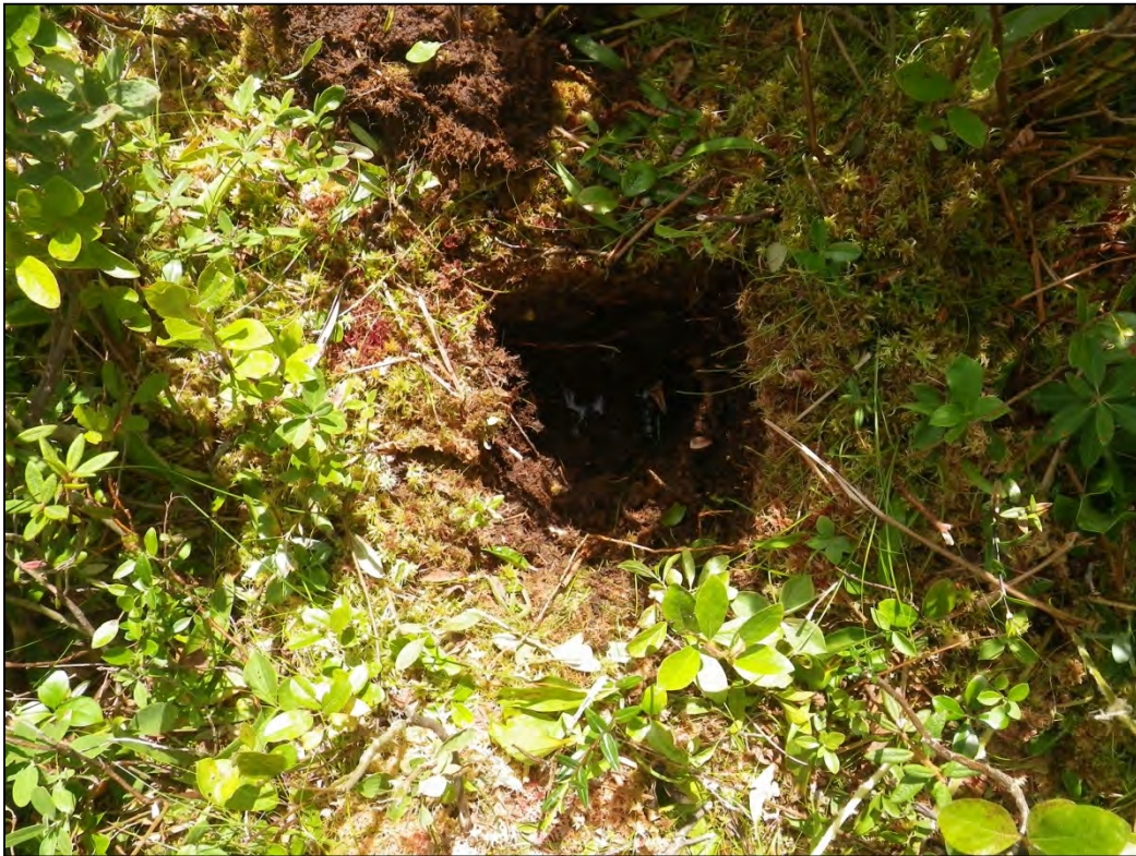
Photograph 42: Wetland 11 (WL11) – Wetland Test Pit