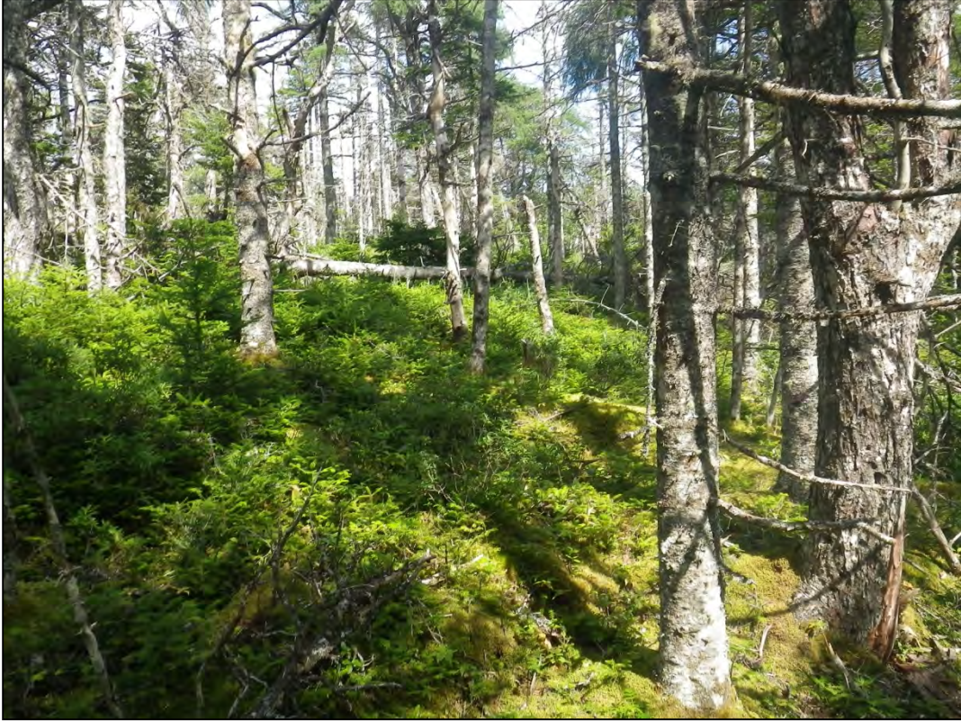
Photograph 64: Wetland 16 (WL16) – Upland Habitat