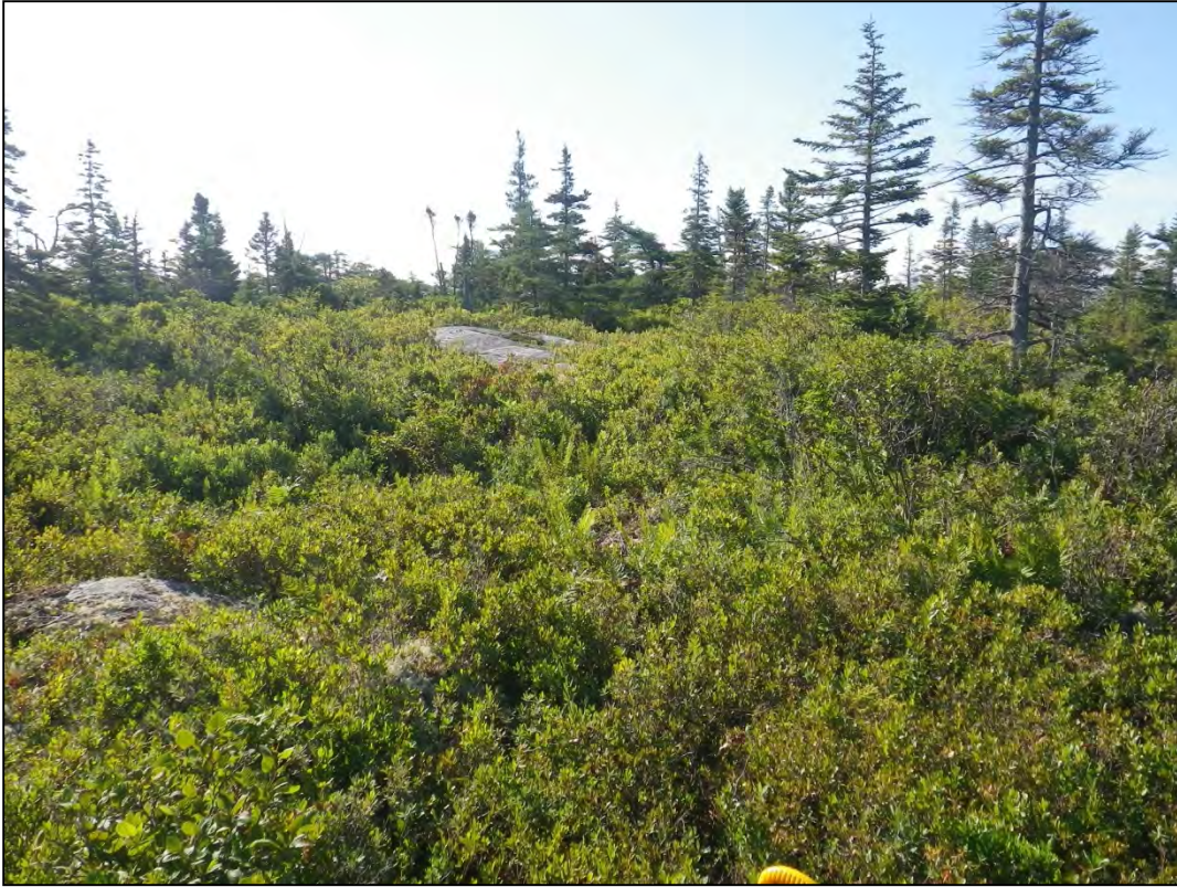
Photograph 48: Wetland 12 (WL12) – Upland Habitat