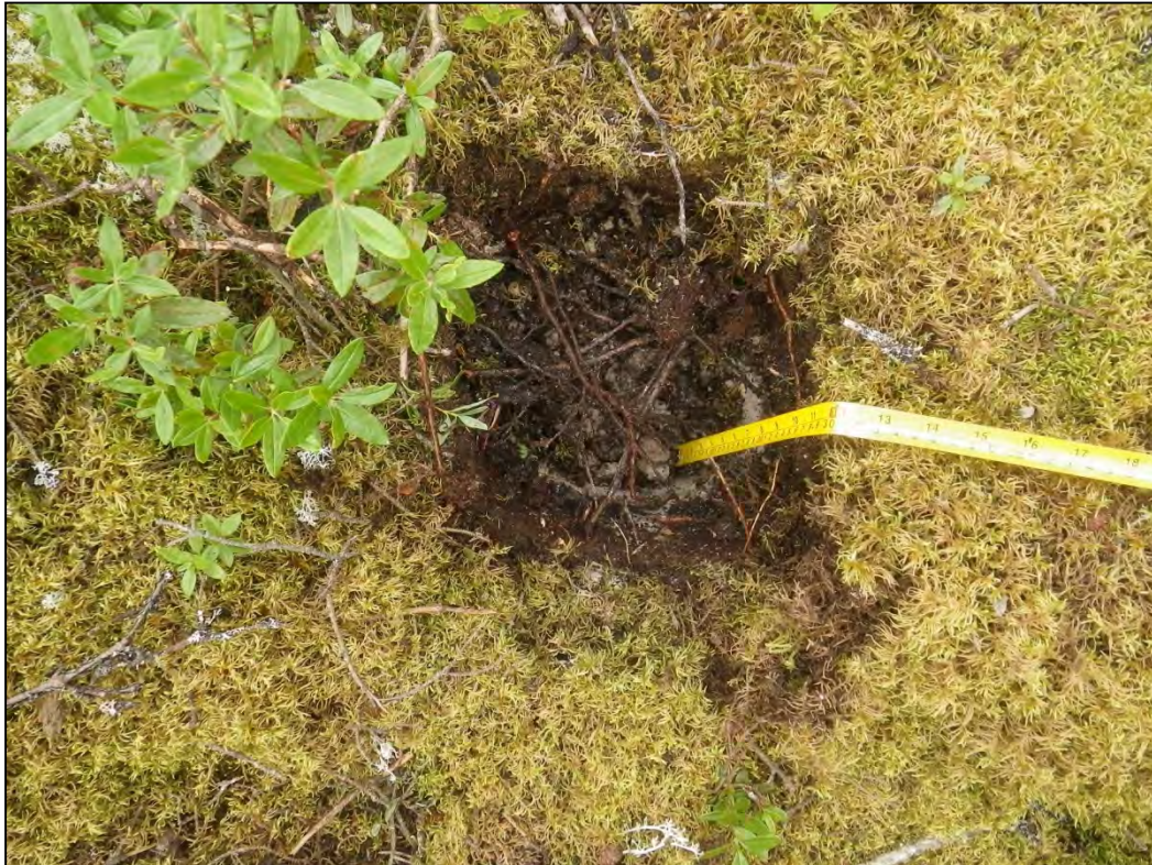
Photograph 16: Wetland 4 (WL4) – Upland Test Pit