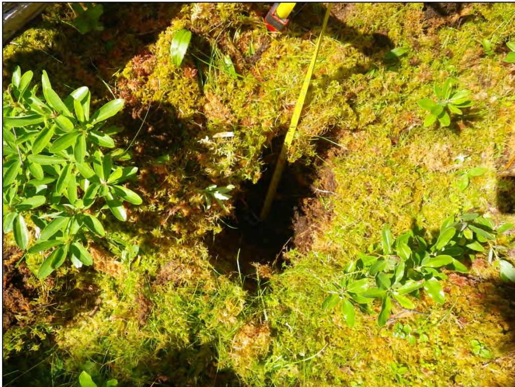
Photograph 6: Wetland 2 (WL2) – Wetland Test Pit