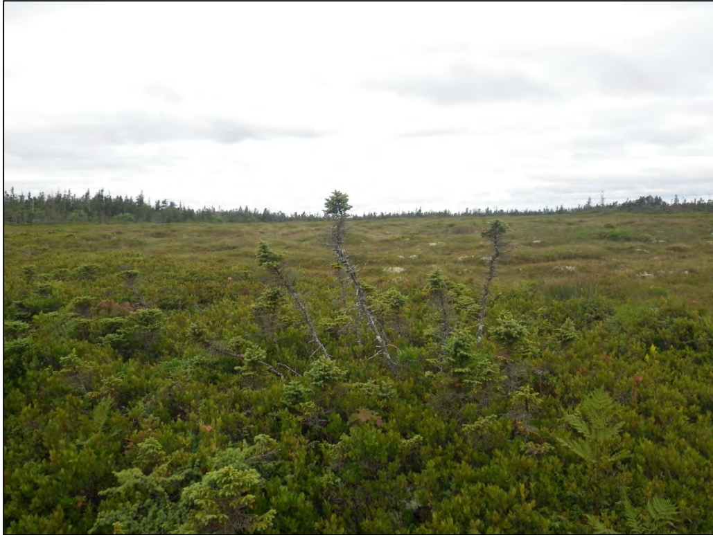
Photograph 33: Wetland 9 (WL9) – Wetland Habitat