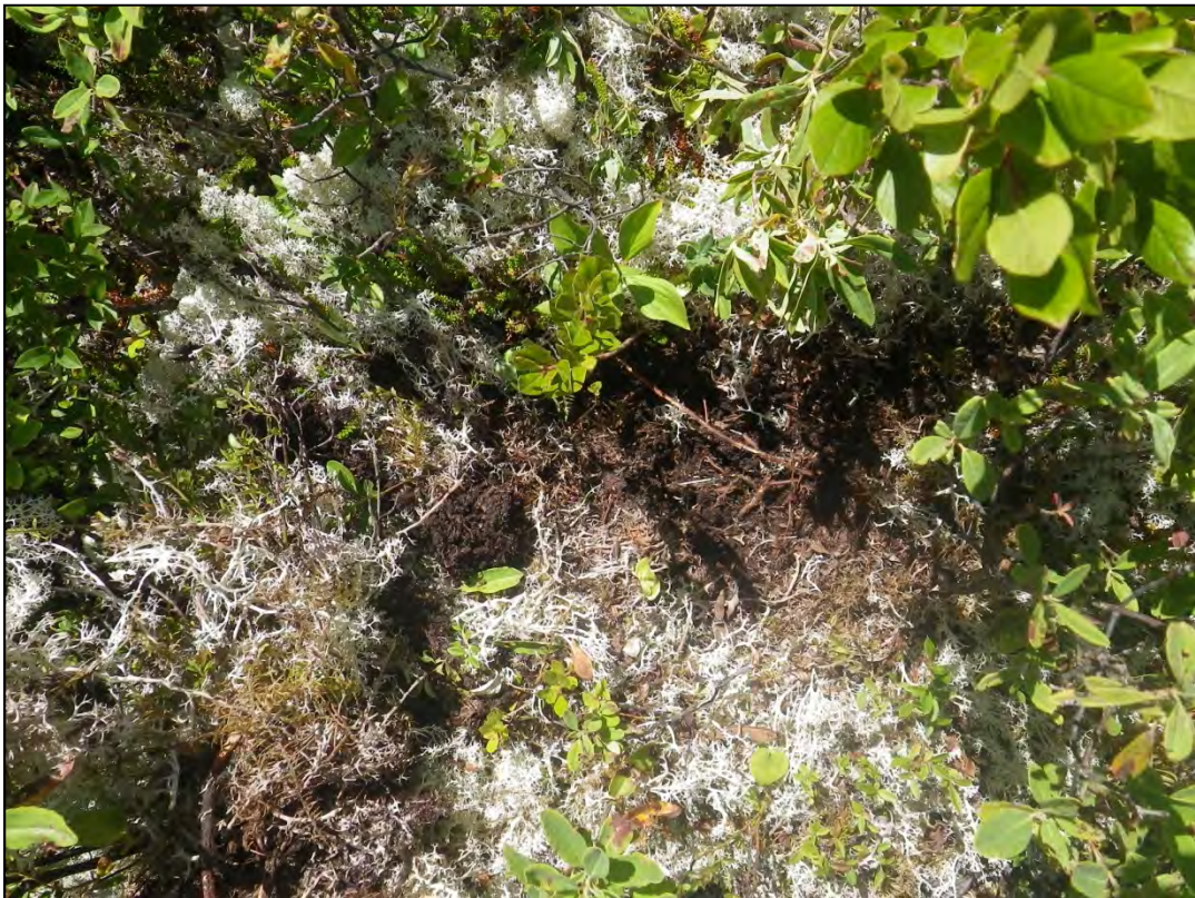
Photograph 57: Wetland 14 (WL14) – Upland Test Pit