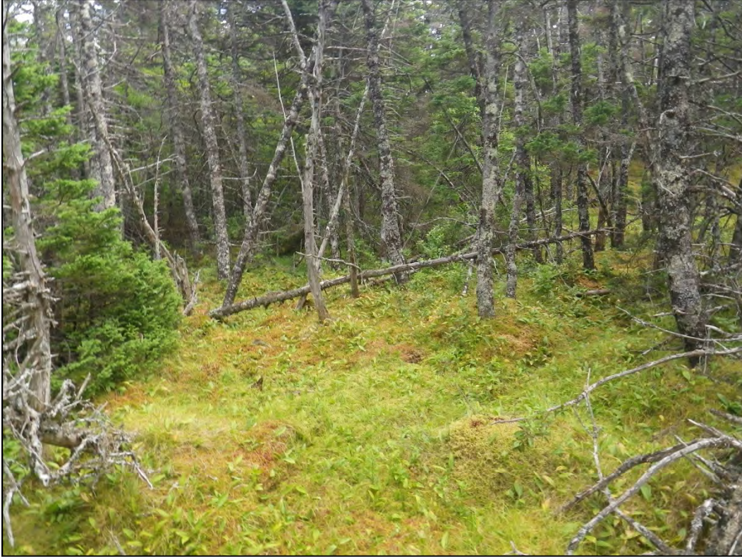
Photograph 13: Wetland 4 (WL4) – Wetland Habitat