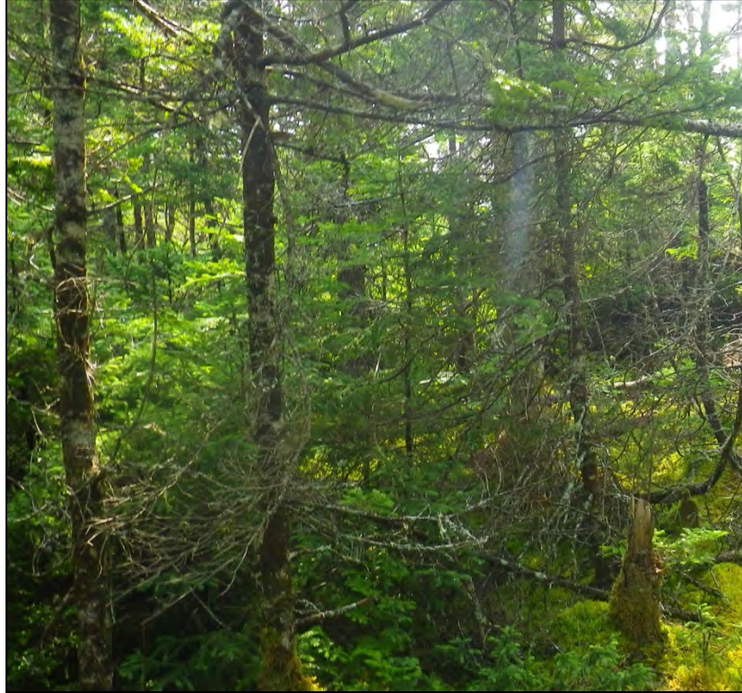
Photograph 11: Wetland 3 (WL3) – Upland Habitat