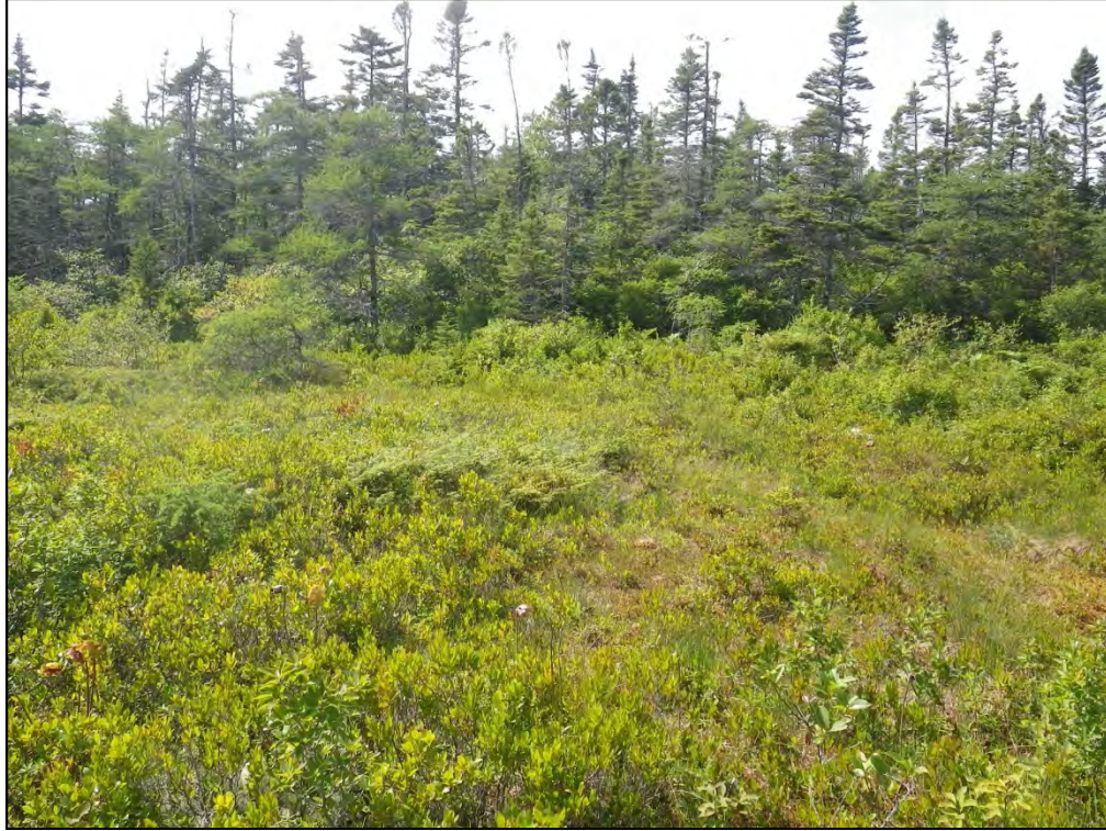
Photograph 74: Wetland 19 (WL19) – Wetland Habitat