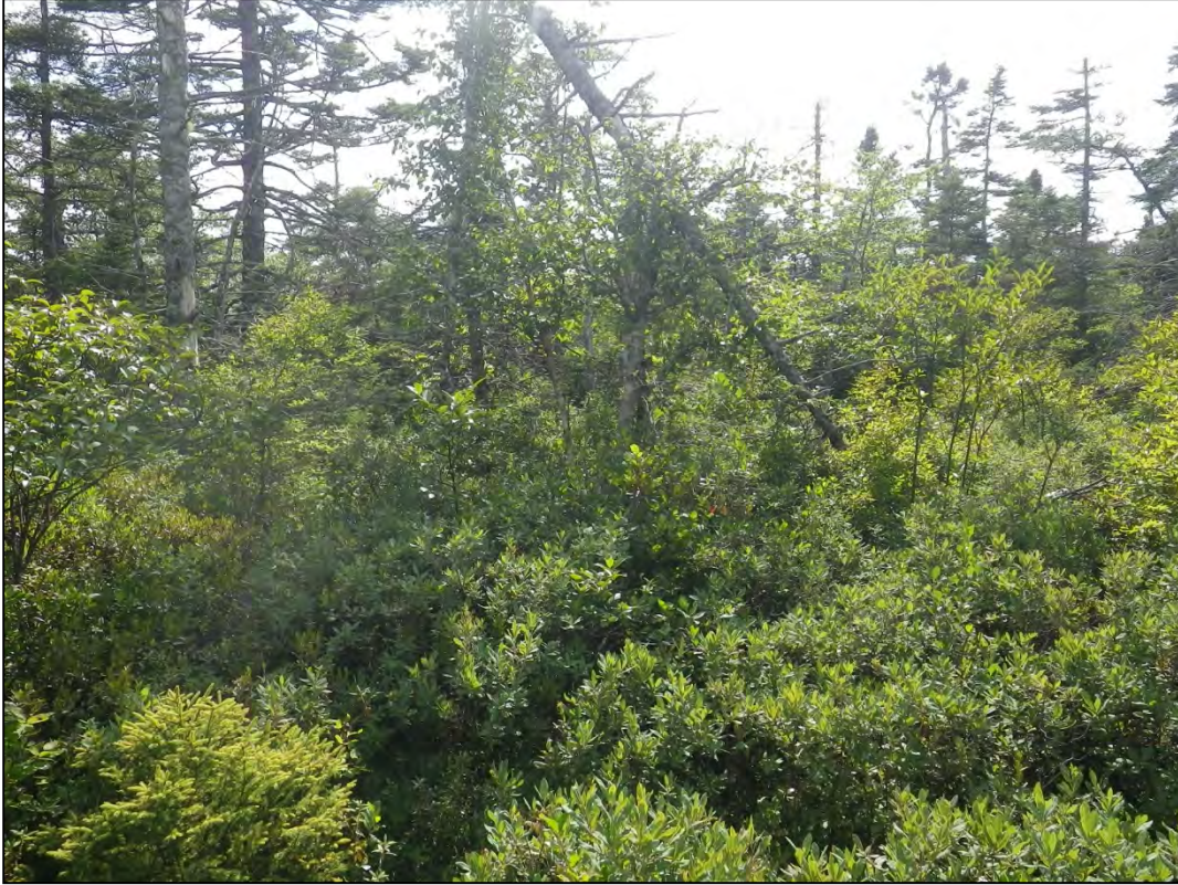
Photograph 80: Wetland 20 (WL20) – Upland Habitat