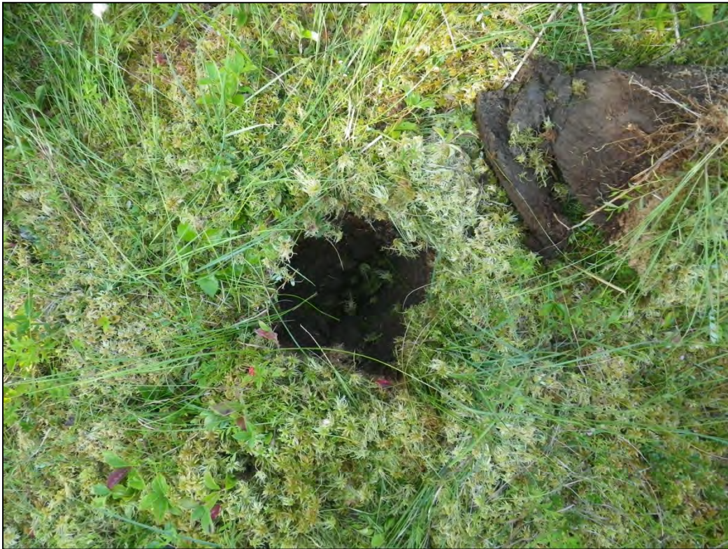
Photograph 83: Wetland 21 (WL21) – Wetland Test Pit