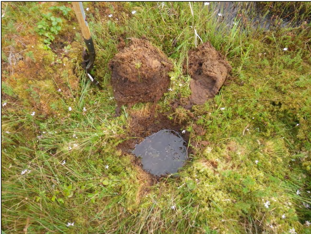
Photograph 18: Wetland 5 (WL5) – Wetland Test Pit