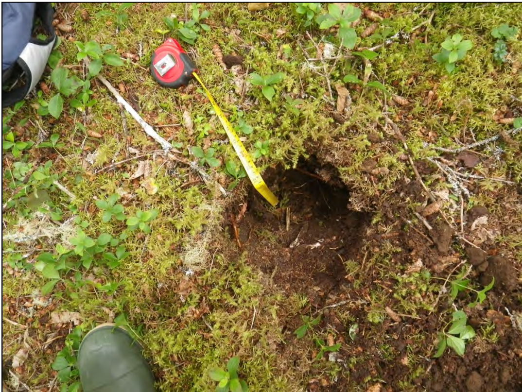
Photograph 89: Wetland 22 (WL22) – Upland Test Pit