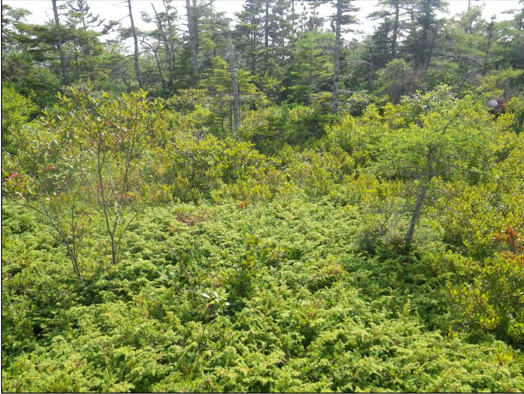
Photograph 76: Wetland 19 (WL19) – Upland Habitat