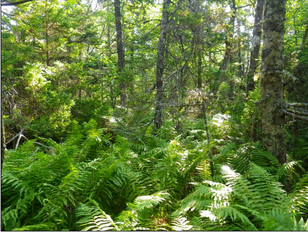
Photograph 29: Wetland 8 (WL8) – Wetland Habitat