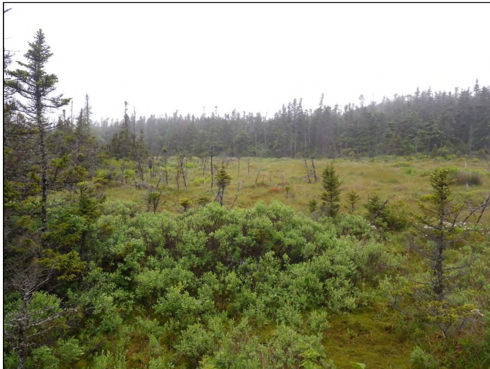
Photograph 54: Wetland 14 (WL14) – Wetland Habitat