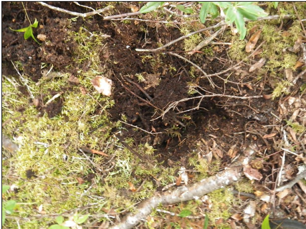
Photograph 36: Wetland 9 (WL9) – Upland Test Pit