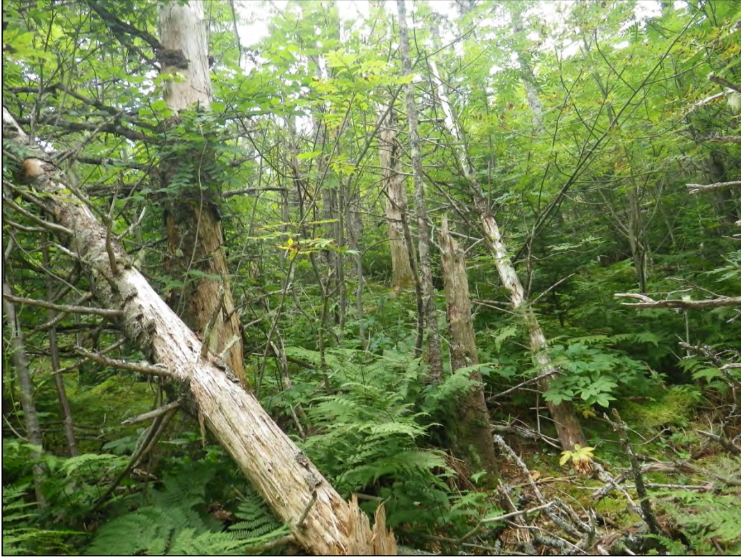
Photograph 88: Wetland 22 (WL22) – Upland Habitat