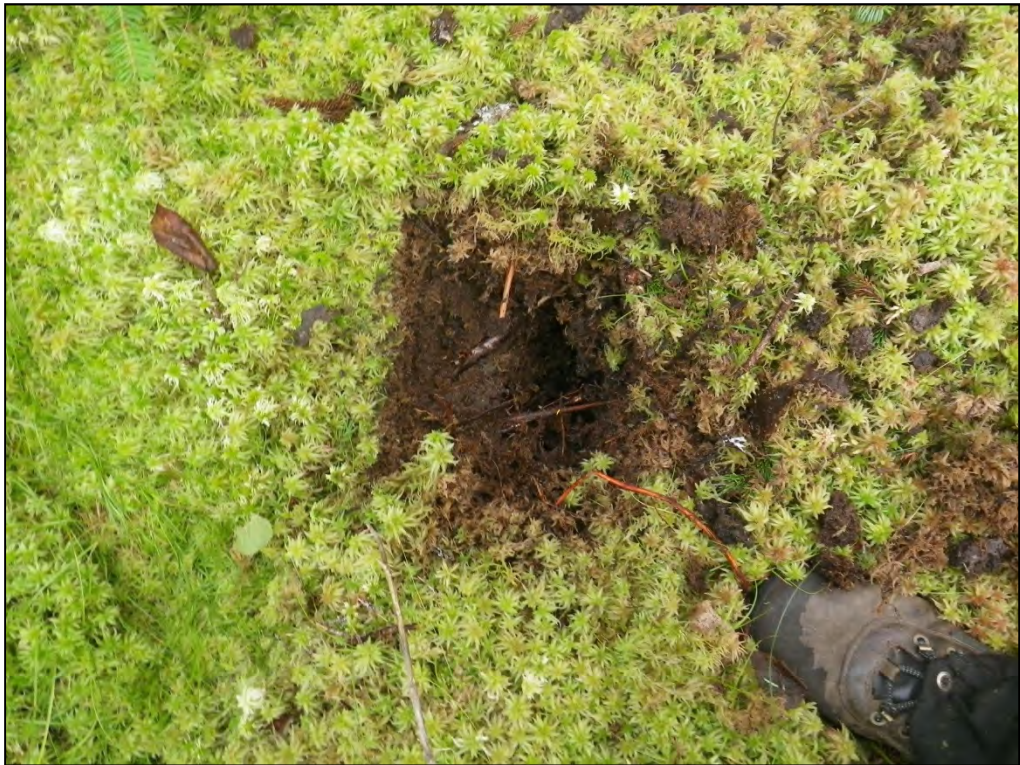
Photograph 38: Wetland 10 (WL10) – Wetland Test Pit