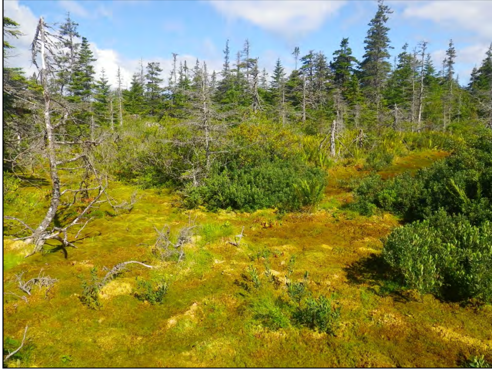
Photograph 58: Wetland 15 (WL15) – Wetland Habitat