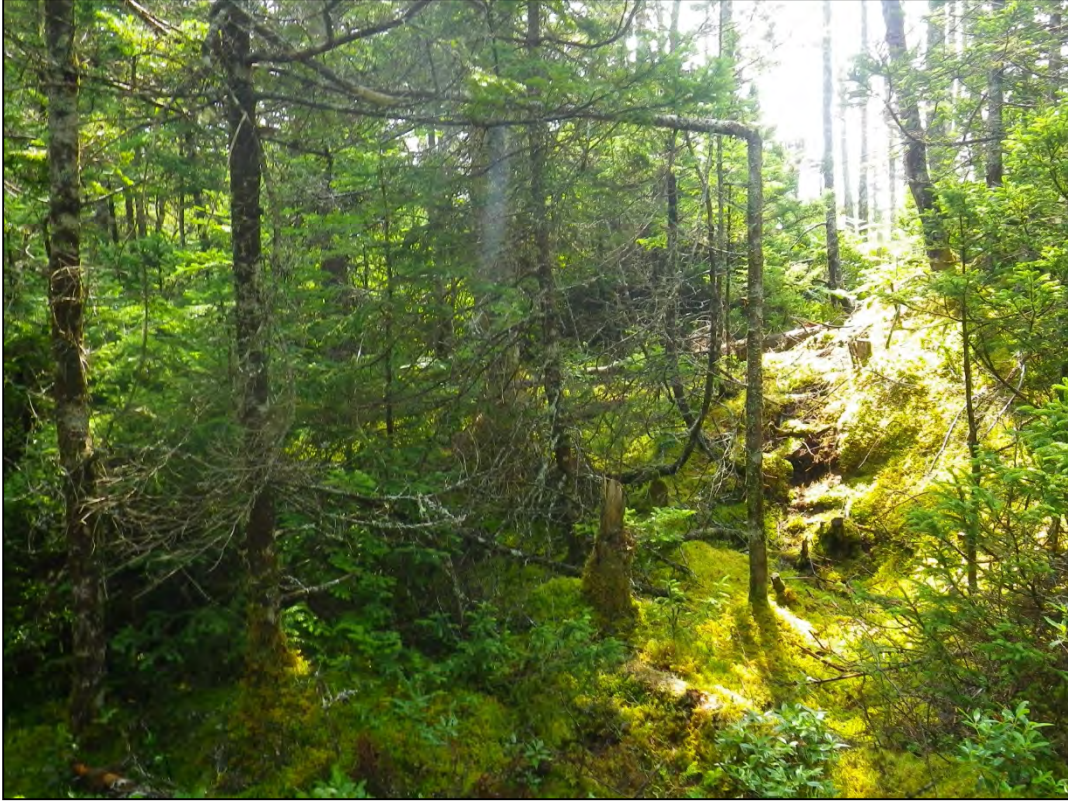
Photograph 68: Wetland 17 (WL17) – Upland Habitat