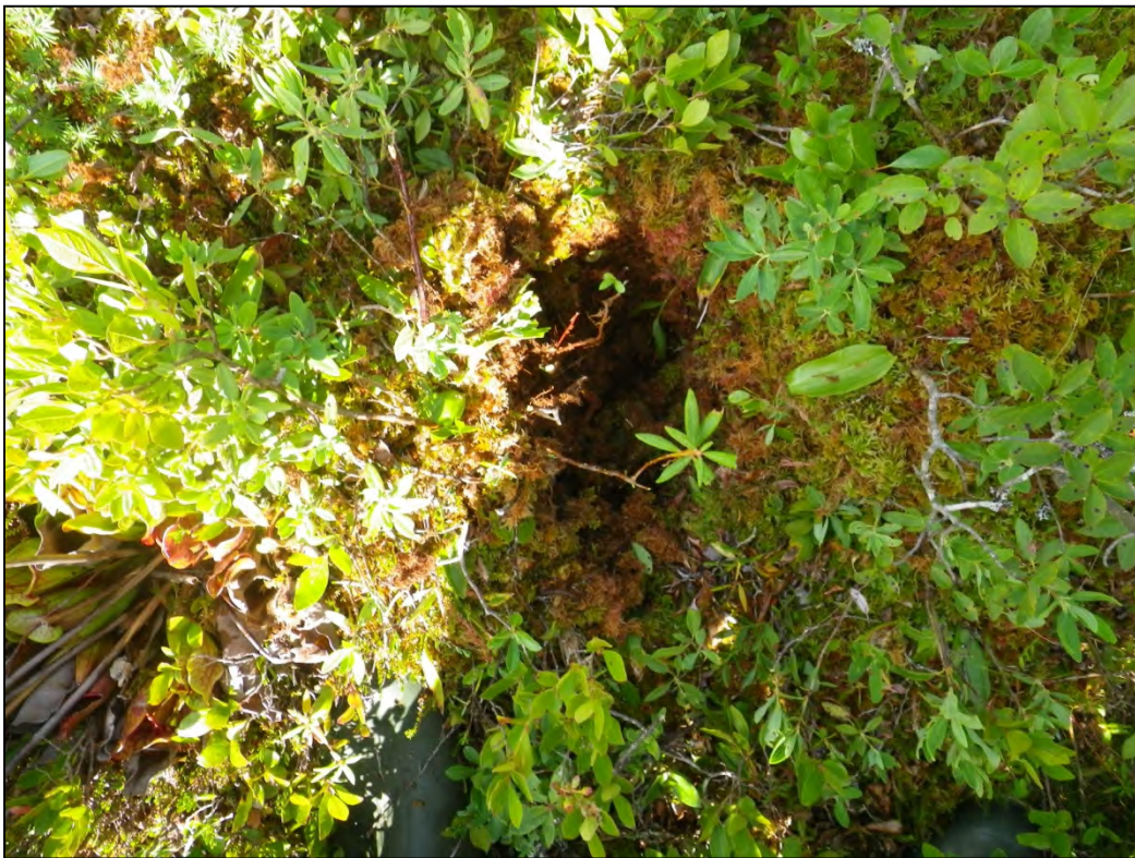
Photograph 75: Wetland 19 (WL19) – Wetland Test Pit