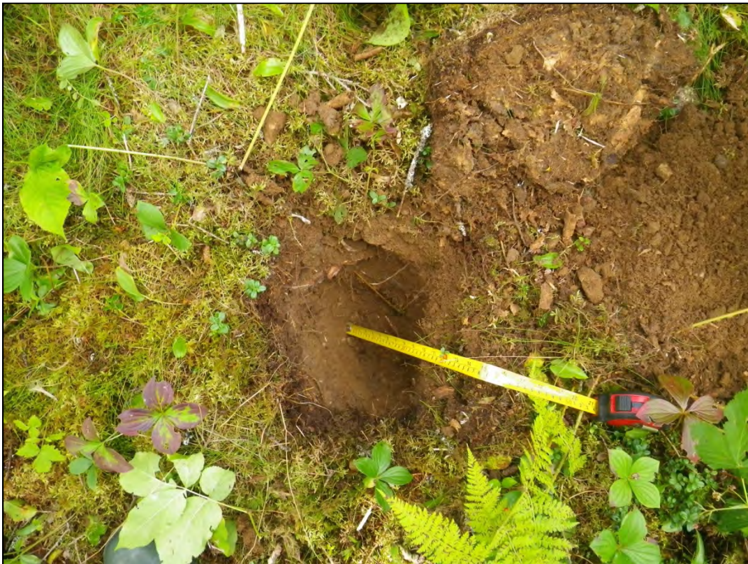
Photograph 85: Wetland 21 (WL21) – Upland Test Pit