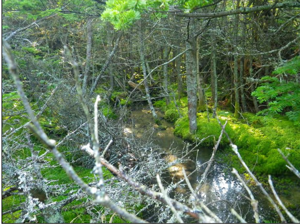
Photograph 19: Wetland 5 (WL5) – Upland Habitat