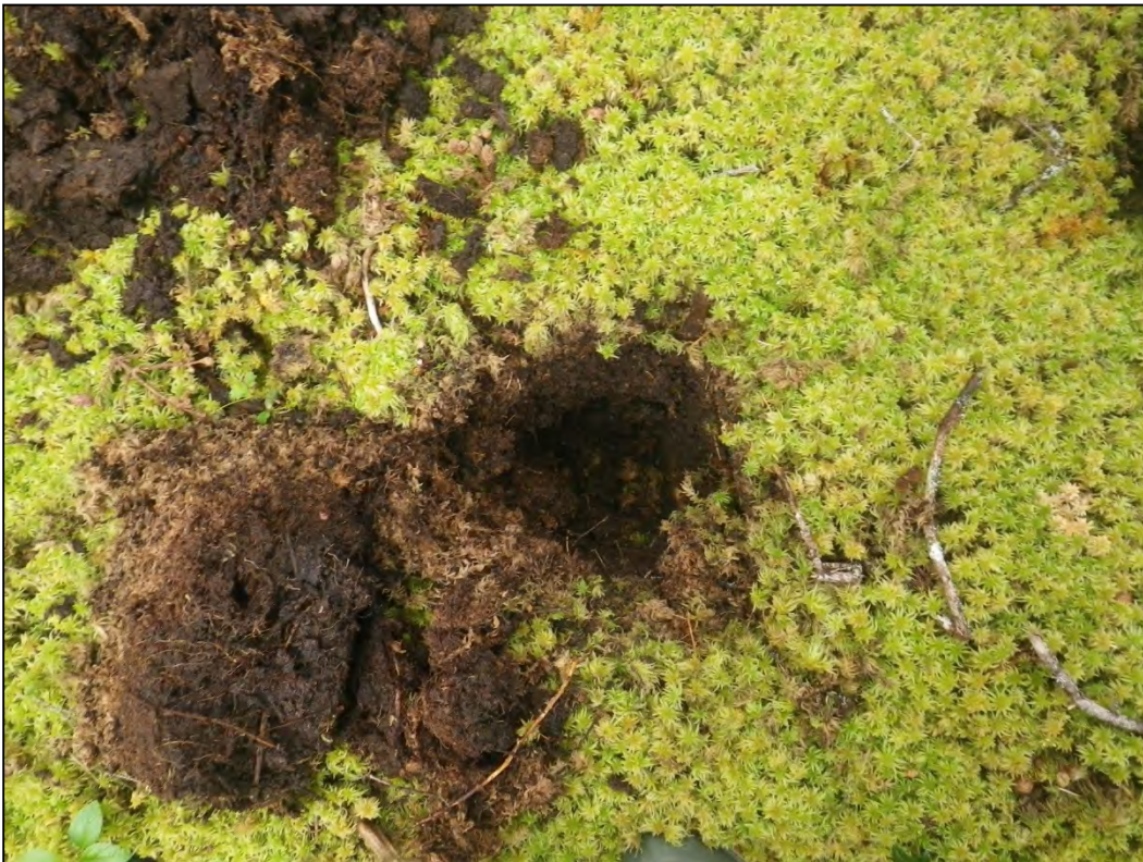
Photograph 26: Wetland 7 (WL7) – Wetland Test Pit