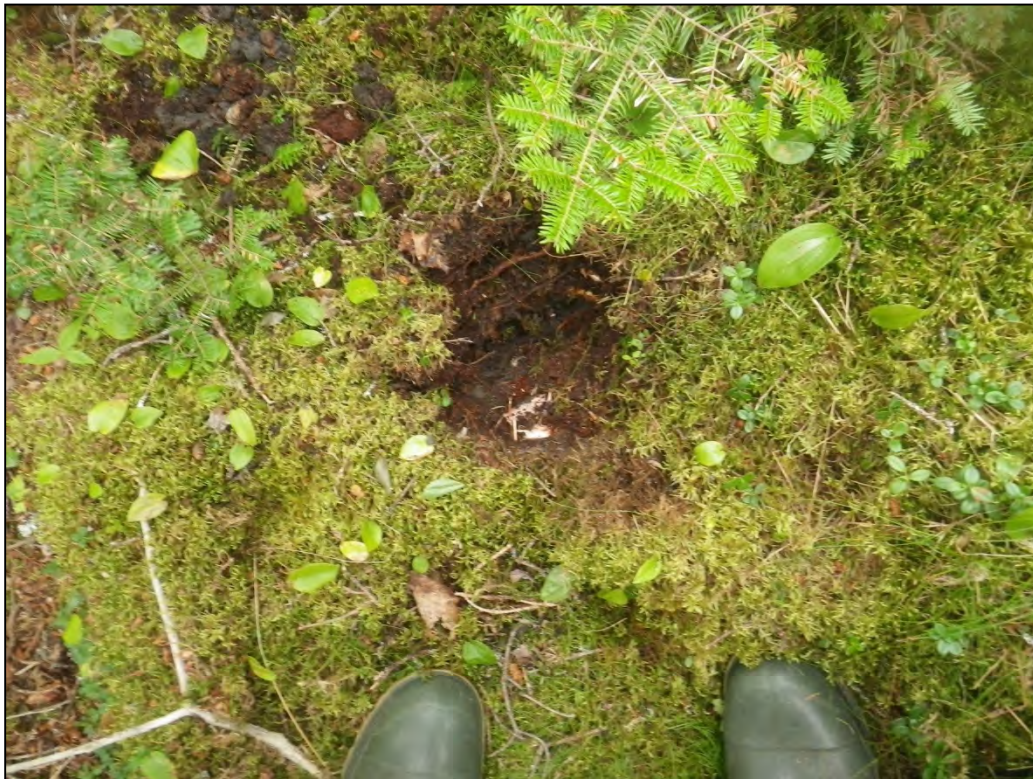
Photograph 12: Wetland 3 (WL3) – Upland Test Pit