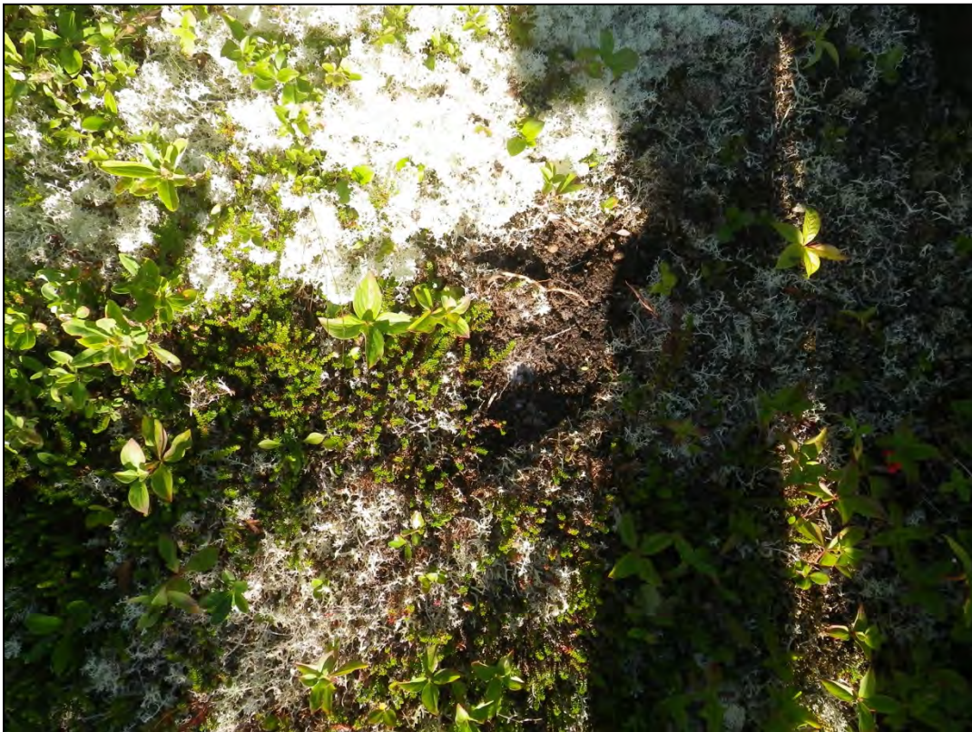
Photograph 53: Wetland 13 (WL13) – Upland Test Pit