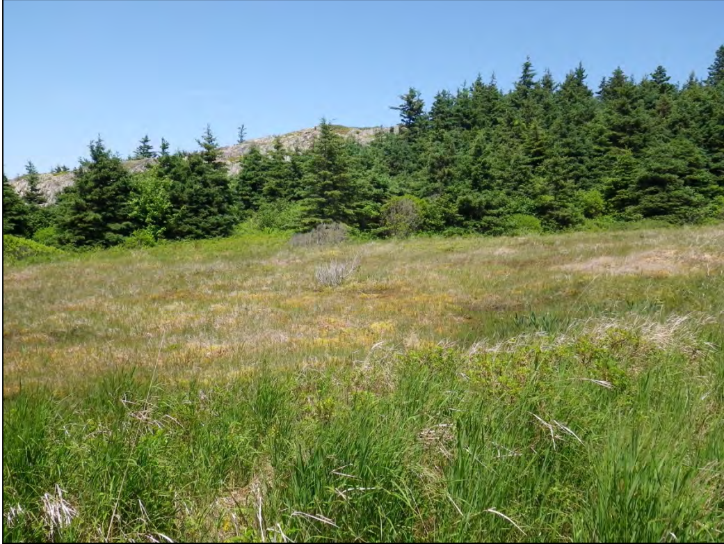
Photograph 17: Wetland 5 (WL5) – Wetland Habitat