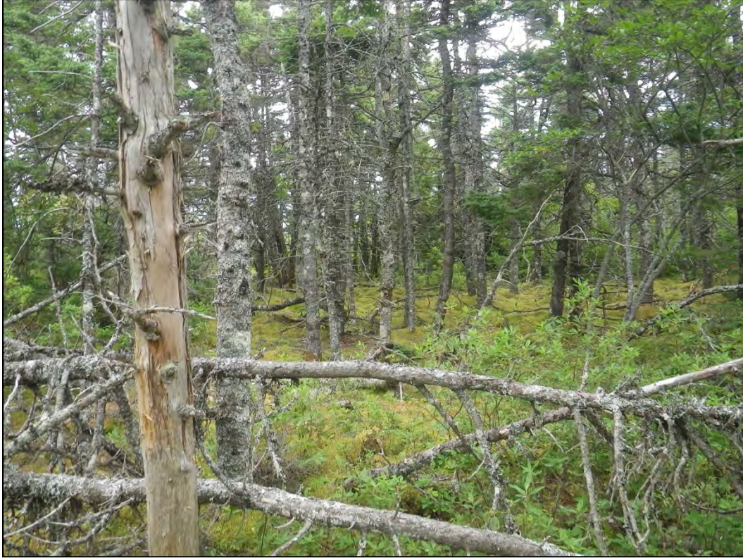
Photograph 15: Wetland 4 (WL4) – Upland Habitat