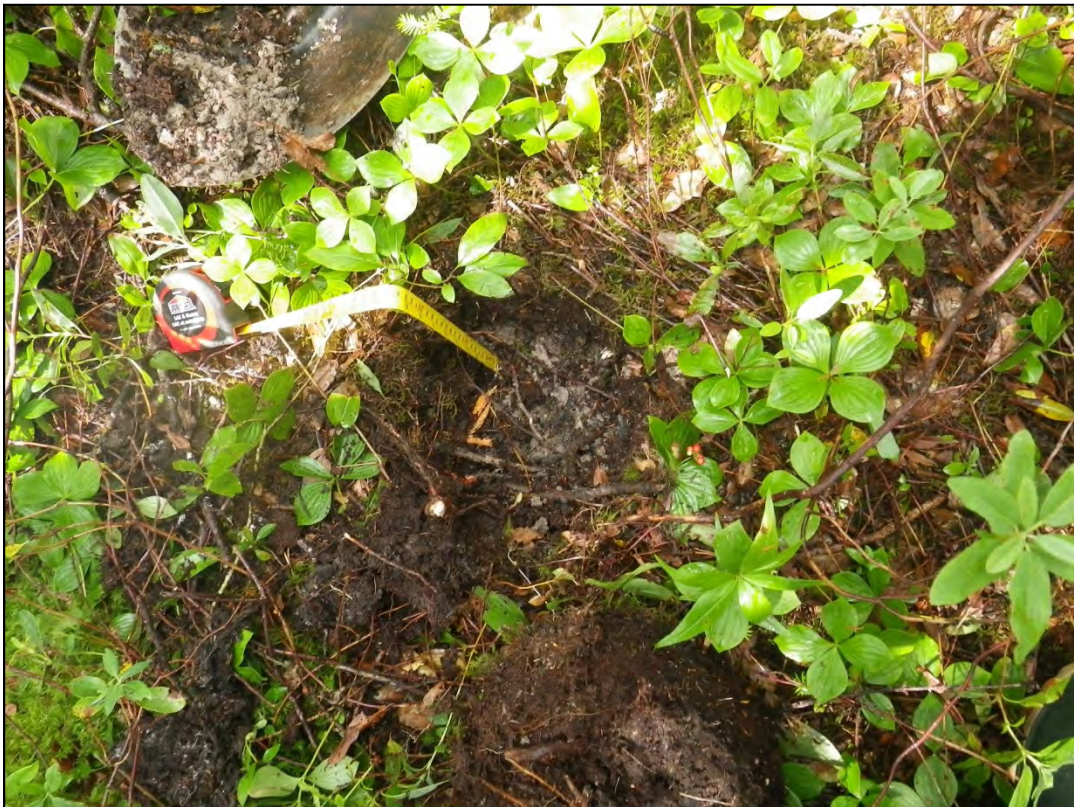
Photograph 73: Wetland 18 (WL18) – Upland Test Pit