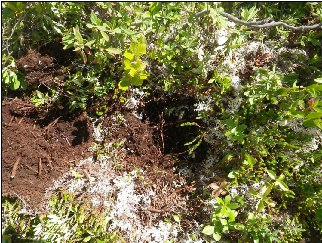
Photograph 45: Wetland 11 (WL11) – Upland Test Pit