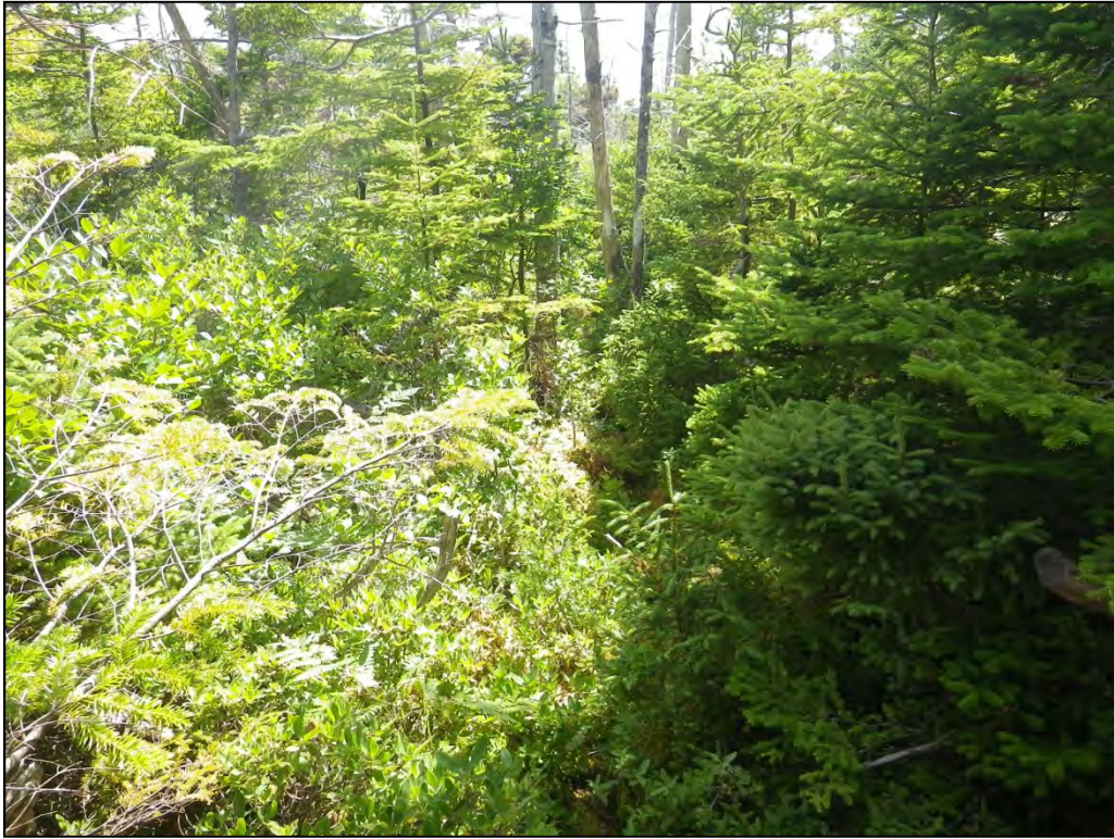
Photograph 5: Wetland 2 (WL2) – Wetland Habitat