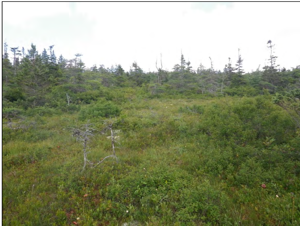
Photograph 78: Wetland 20 (WL20) – Wetland Habitat