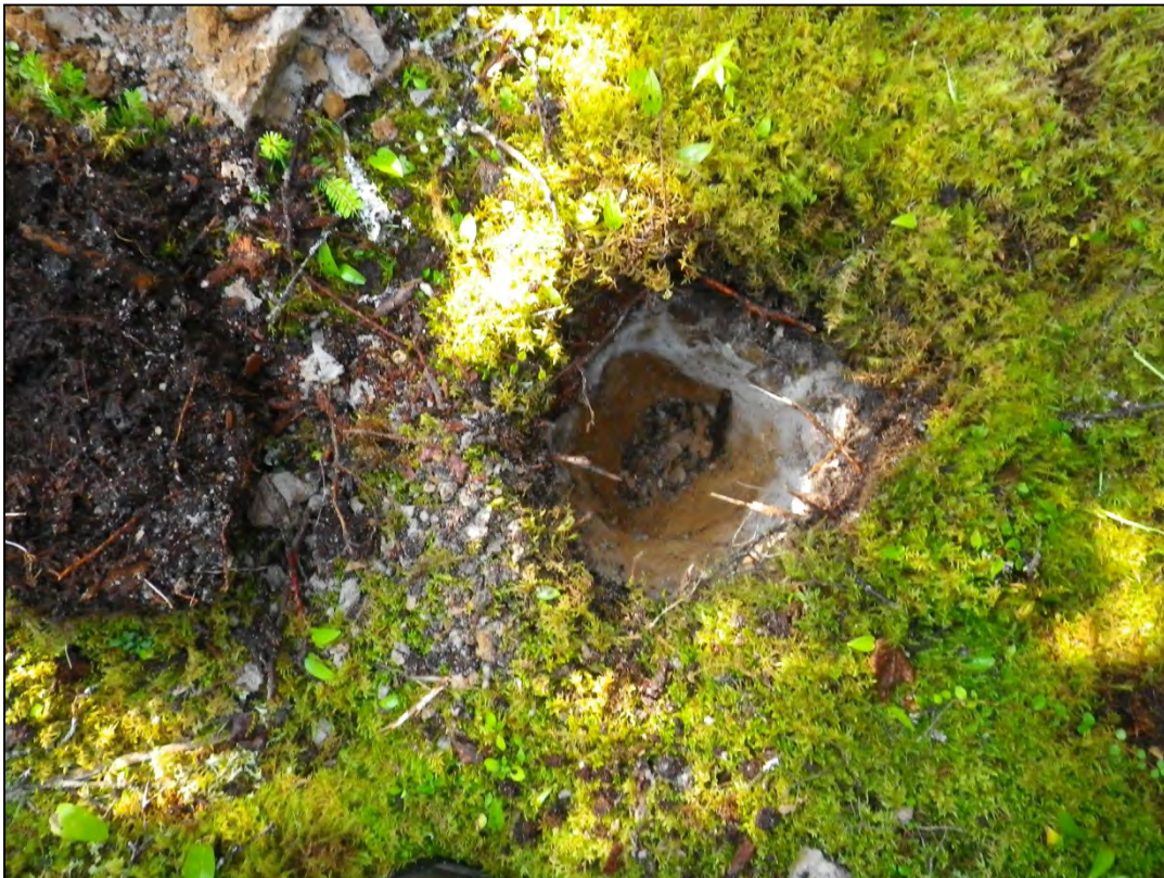
Photograph 24: Wetland 6 (WL6) – Upland Test Pit