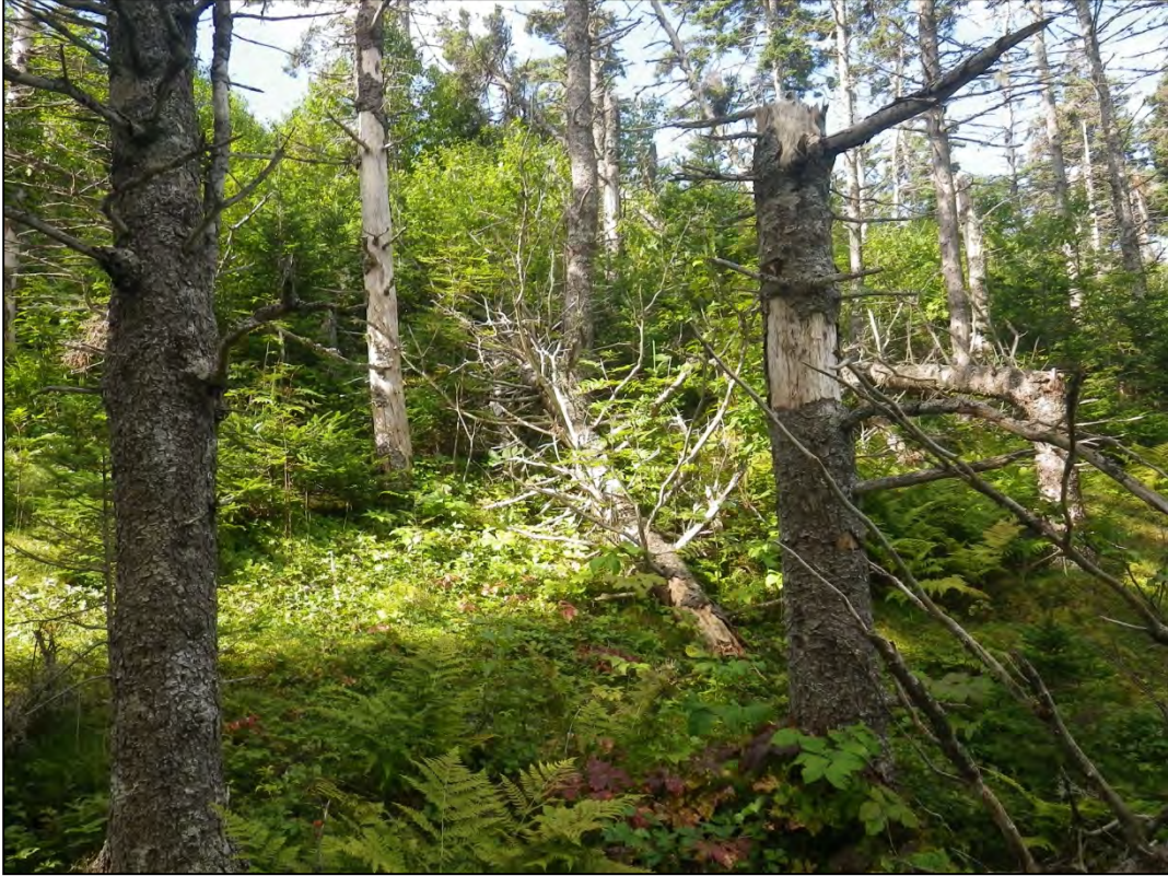
Photograph 84: Wetland 21 (WL21) – Upland Habitat