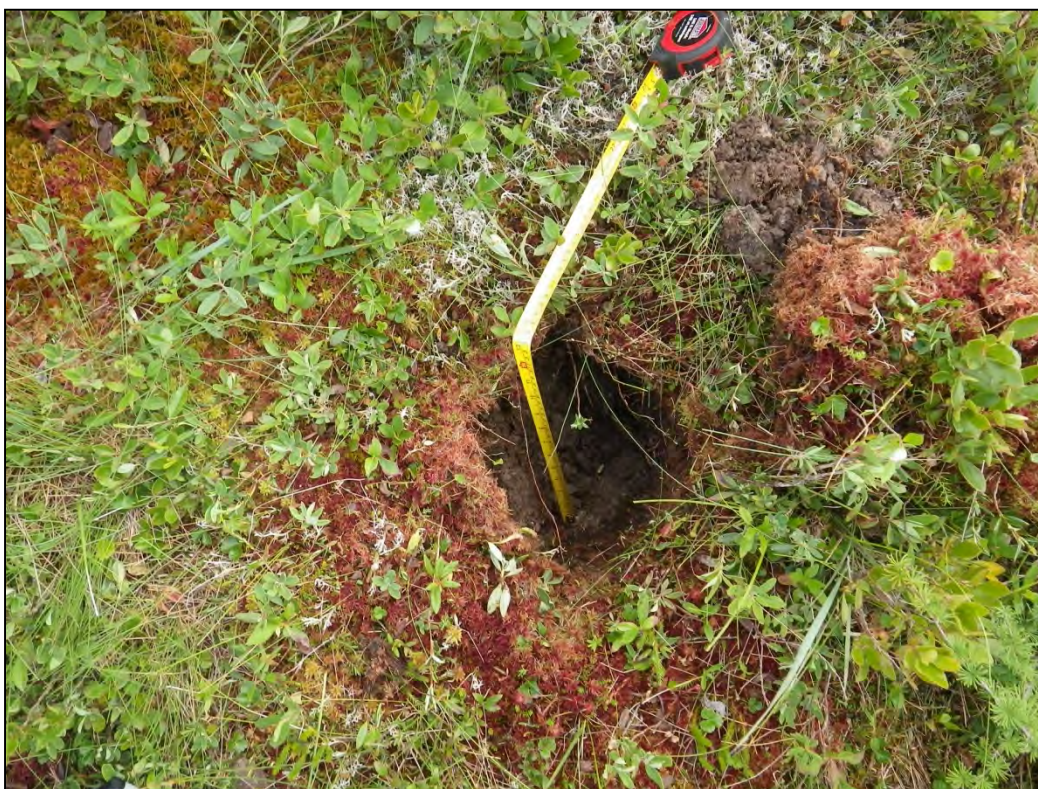
Photograph 79: Wetland 20 (WL20) – Wetland Test Pit