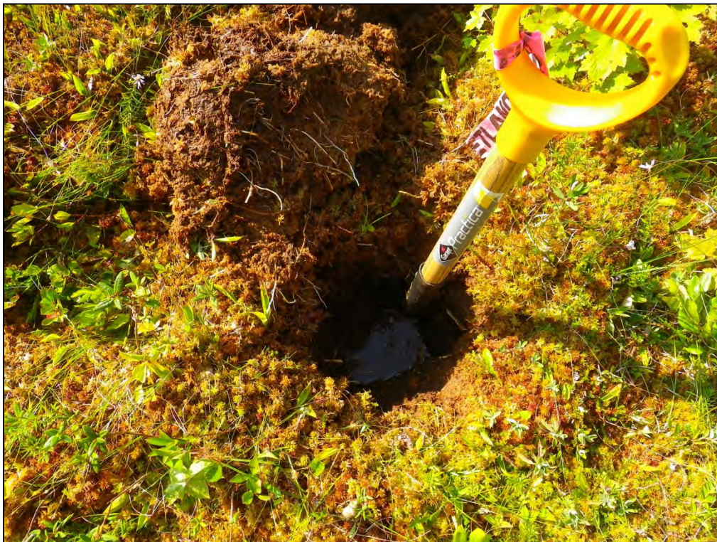
Photograph 22: Wetland 6 (WL6) – Wetland Test Pit