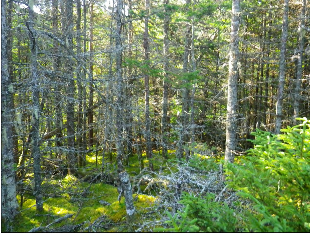
Photograph 23: Wetland 6 (WL6) – Upland Habitat