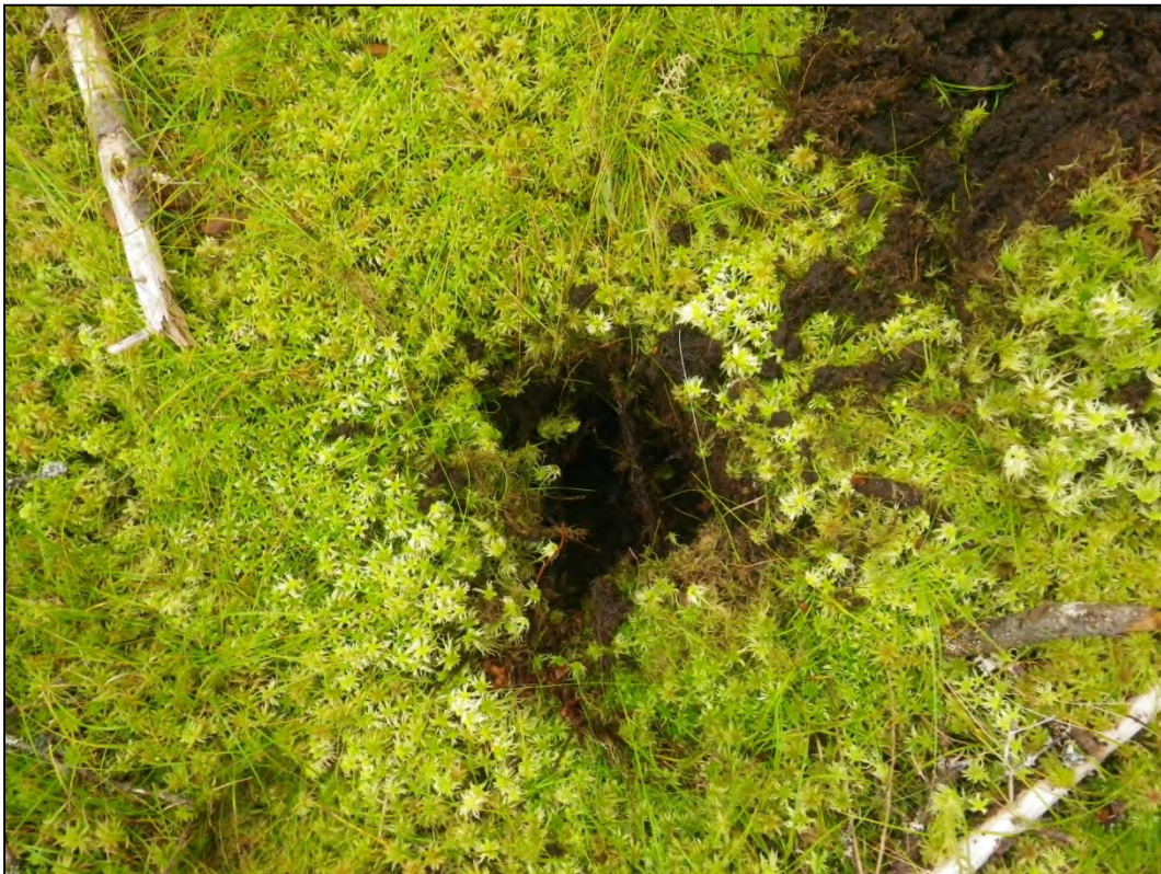
Photograph 30: Wetland 8 (WL8) – Wetland Test Pit