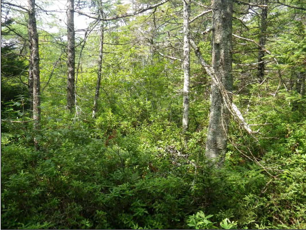
Photograph 72: Wetland 18 (WL18) – Upland Habitat