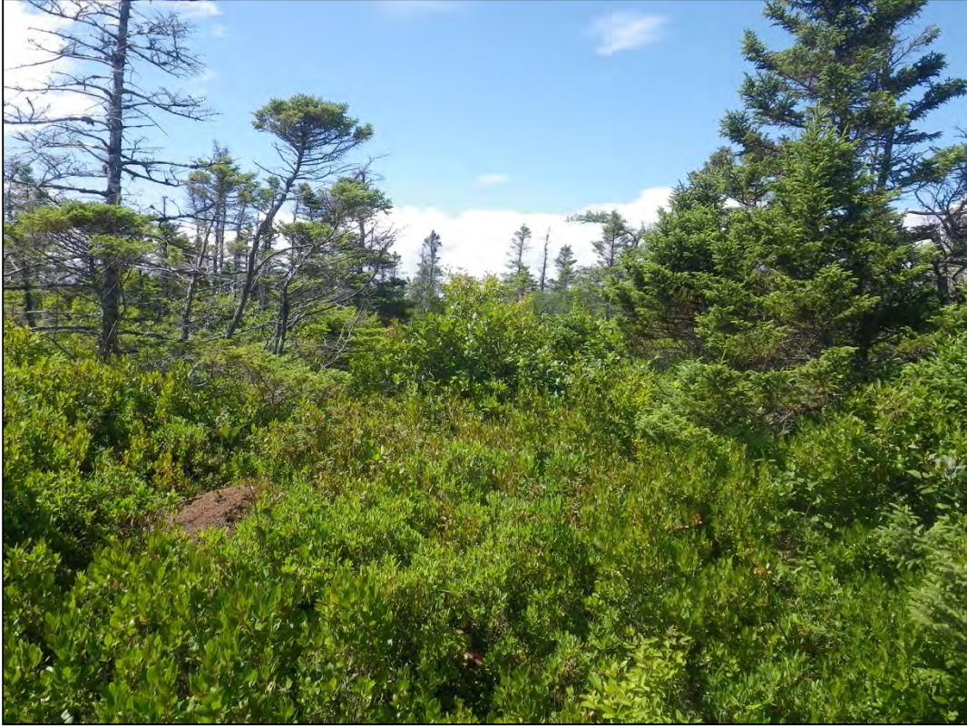
Photograph 56: Wetland 14 (WL14) – Upland Habitat