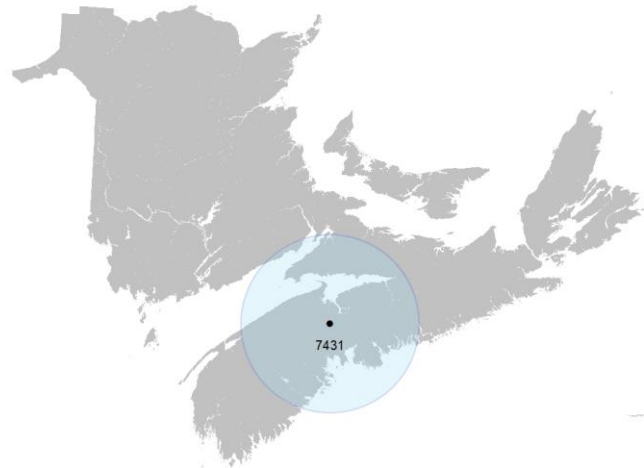
Map 1. A 100 km buffer around the study area