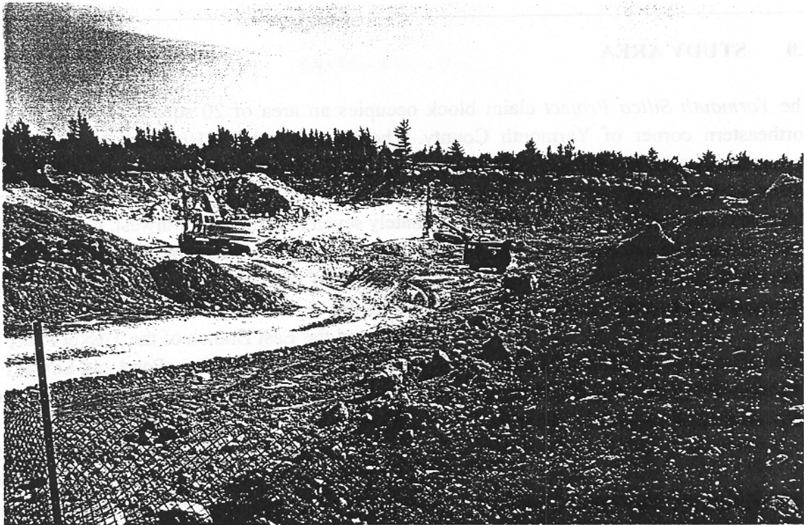
Plate 1: Exploration pit north of Highway 203, October 4, 2000.