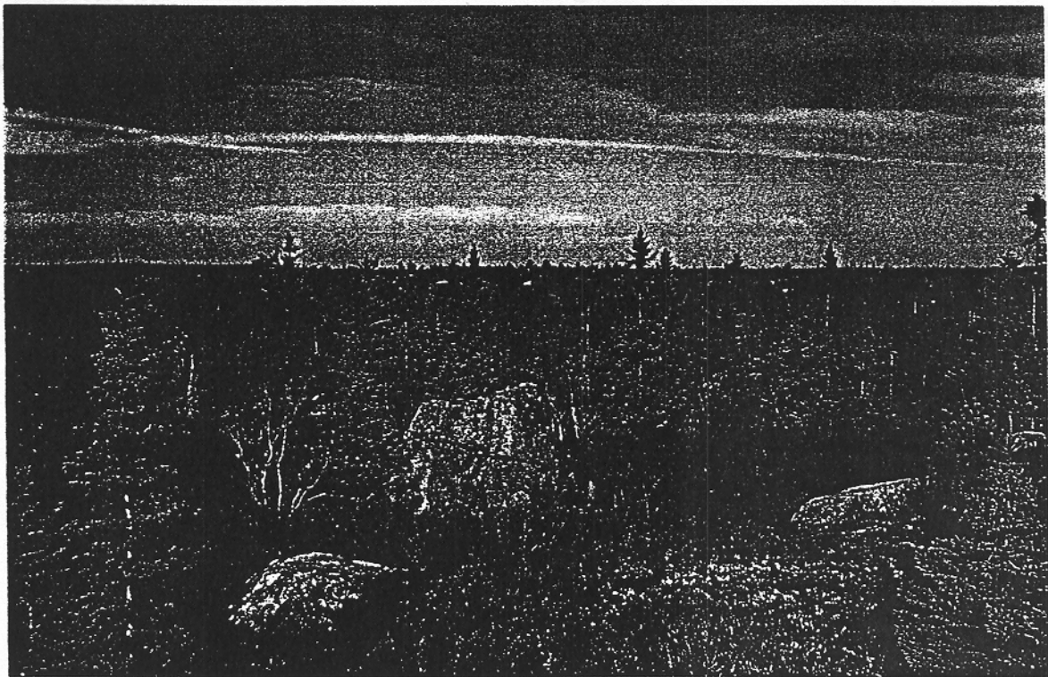
Plate 2: Landscape at north end of claim block, October 26, 2000.