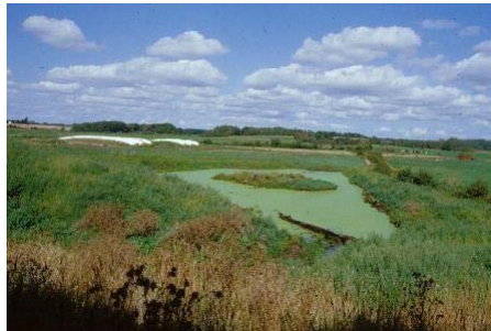
Same area shown just after restoration of open water habitat - September 2003

John Wile, Habitat Biologist Ducks Unlimited Canada Amherst, Nova Scotia