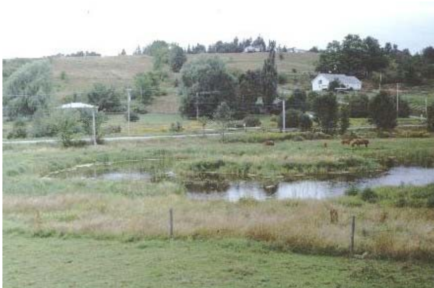
A Pasture Pond with Fenced Riparian Buffer