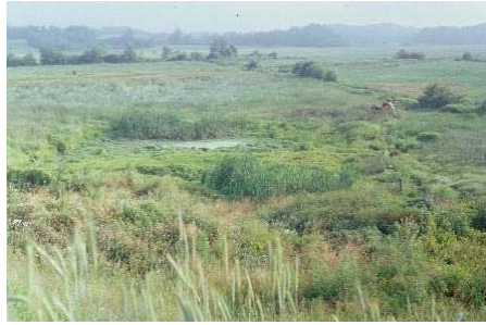
Typical farm wetland before restoration showing in-filled marsh - June 2003

Credit was / will be given to the Habitat Conservation Fund for their financial contribution at all public presentations made by DUC throughout the year or to the network of DUC volunteers throughout the province.