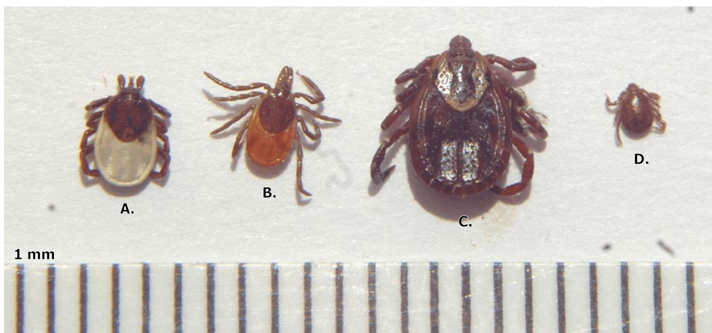
Fig. 1 Images of adult ticks commonly found in Nova Scotia. A. Groundhog Tick; B. Blacklegged Tick; C. American Dog Tick; D. Snowshoe Hare Tick. (All enlarged)

Adults are common during summer months on snowshoe hare.