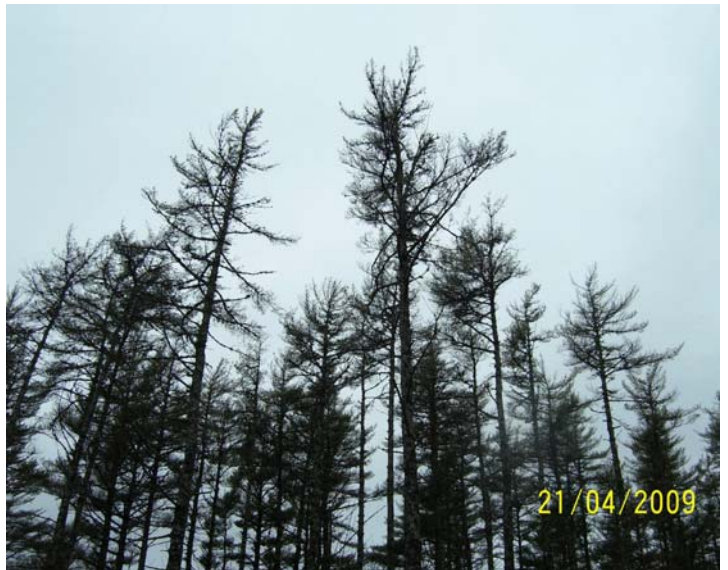
Fig. 4 Jack pine budworm defoliation in mature white pine.

Since 25 May, Forest Health staff have been conducting weekly site visits to one of our current JPBW infestations at 4th Lake Flowage, Digby Co. Larvae were sampled from white pine foliage in order to determine their development stage and better understand JPBW biology as it exists in Nova Scotia. From this information we can determine the approximate calendar dates along with the heat unit data as it goes through each stage of its life from egg, larva, pupa, and adult. This information is invaluable when deciding monitoring, assessment, and management options before, during and after an outbreak.