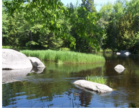
Beauty is in the eyes of the beholder!

Not far from the entrance to Kejimikujik National Park you will find the woodlot of Christine and Royce Ford which has been in the Ford family for three generations. The 750 acre property provided exceptional learning opportunities to more than 100 children and their teachers from schools around the property on September 12. The topics covered included marine life, wildlife habitat, minerals, fire management, law enforcement, tree identification, and insects. This outdoor activity not only meets the curriculum requirements but also provides opportunity for children to go outside , exercise, explore, and reconnect with nature!