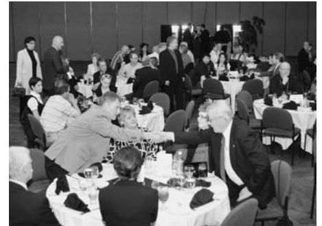
16th Apprenticeship Celebration Event — May 29th, 2010 Membertou Trade and Convention Centre.

Thank you to everyone who came out for this event and congratulations to the newly certified journeypersons. ■