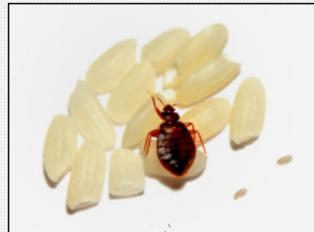
A photo of a bed bug after feeding. Two eggs are next to it. The rice provides size comparison.

A quick and easy first step to check for bed bugs is to put double-sided tape around your bed or furniture. When the bed bugs walk across it, they will become stuck. They tend to walk where pipes and electrical sockets break the walls, along baseboards and under