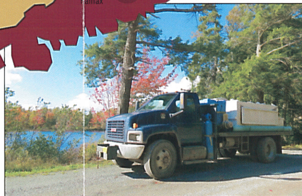
Fish Hatchery Distribution Truck. Each fall over 200 lakes and streams are stocked with trout or salmon fingerlings (parr).