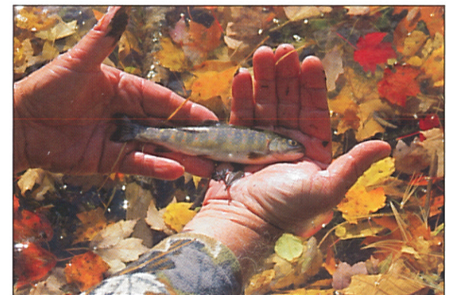
Brook trout fall fingerling.