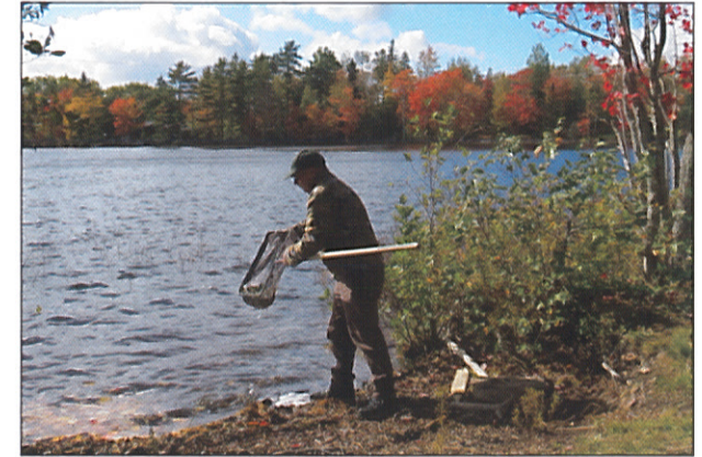
Hatchery staff stocking trout in the fall.