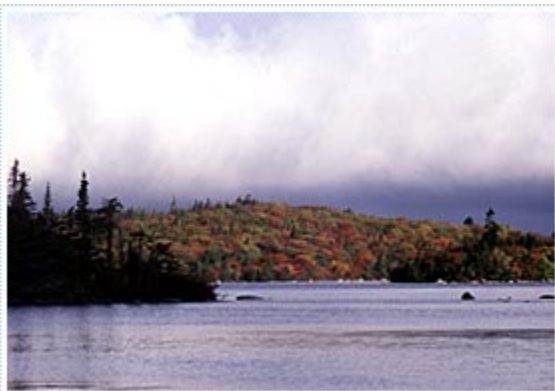
Above: A famous local attraction, known as MacIntosh Run

The Community Counts system was able to contribute neighborhood level data on some of the major indicators of healthy and strong communities, such as demographics, economics, labour, and education.