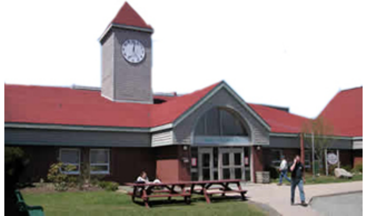
Captain William Spry Community Centre located at 10 Kidston Road, Spryfield

In 2005, local people who became involved in a two-year project called “Action For Neighbourhood Change” wanted to find out what responses they would get to such questions in Spryfield, a diverse neighbourhood with long, historical roots in Halifax. They went out and asked other members of their community those very questions, and found the answers they heard to help bring about a whole raft of positive changes for the community of Spryfield. In addition to the knowledge, information and history collected from the members of the community, the project also required evidence to support decision making and program planning, which is where Community Counts became an essential tool for the project.