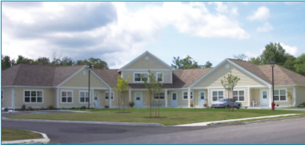
◀ A 15-unit townhouse complex was constructed in Middleton under the New Rental Housing Initiative

The first project under the new Affordable Housing agreement was announced during the first year of the agreement. A 15-unit townhouse complex was constructed in Middleton under the New Rental Housing Initiative. The Town of Middleton was one of the partners on the $1.3 million project, contributing the first 200 feet of road and services for the land. Today the development provides two- and three-bedroom units – several of which are barrier-free – to seniors in the Annapolis Valley.