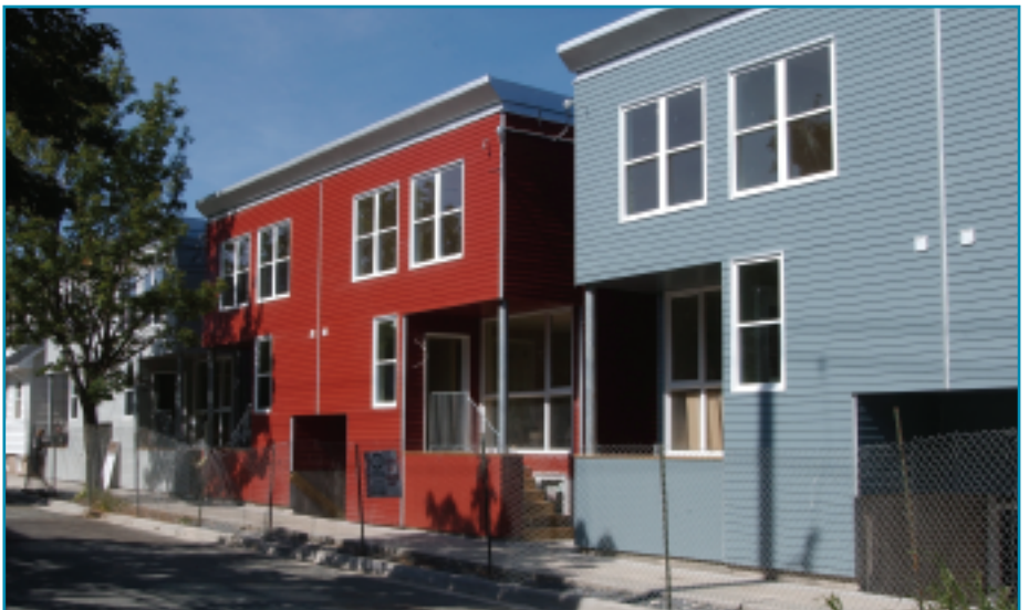
Under the New Home Purchase program , 6 affordable semi-detached housing units were constructed in the north end of Halifax ▶

Under the New Home Purchase program, 6 affordable semi-detached housing units were constructed at a cost of $900,000 in the north end of Halifax. These modest homes will enable moderate-income earners in a designated area of revitalization to move from rental housing to home ownership with the help of a ten-year forgivable loan.