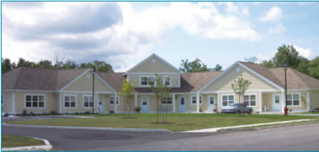
◀ A 15-unit townhouse complex was constructed in Middleton under the New Rental Housing Initiative

The first project under the new Affordable Housing agreement was announced during the first year of the agreement. A 15-unit townhouse complex was constructed in Middleton under the New Rental Housing Initiative. The Town of Middleton was one of the partners on the $1.3 million project, contributing the first 200 feet of road and services for the land. Today the development provides two- and three-bedroom units – several of which are barrier-free – to seniors in the Annapolis Valley.