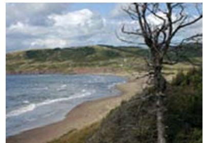
▲ Figure 1: Images, left to right: Some popular spots the public can access coastal Nova Scotia. Cape Breton Highlands National Park; Boardwalk in Lunenburg; West Mabou Beach