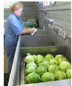
Centralized vegetable processing www.grownlocally.com

GROWN Locally Cooperative (Sunflower Fields CSA) is an alliance of 14 family farms in northeast Iowa. It has succeeded in the predominantly rural area (largest town is 7000) by understanding the demands of the local marketplace (price, value and varieties), diversification and collaborating for larger opportunities such as institutional clients. In 2003 the CSA served 225 families, offering three sizes of boxes (all priced lower than most urban markets) composed of vegetables, flowers, honey, eggs, baked goods, apples, berries, hand-made soaps, herbs, teas, and poultry. Shareholders have the option to purchase additional items (e.g. extra sweet corn, a bushel of canning tomatoes or pickling cucumbers) priced per unit at 80% of wholesale. The farms offer a variety of different delivery and web-based buying clubs targeted at customers such as seniors and students.