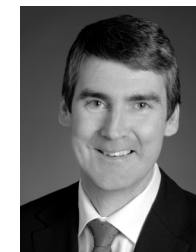
Leader of the Opposition Honourable Stephen McNeil