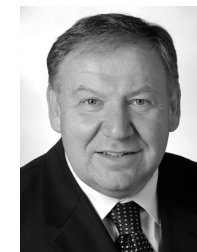
Premier Honourable Darrell Dexter

Any visitor who violates any of the above will be reminded of the rules and could be asked to leave the gallery immediately.