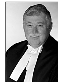
Speaker Honourable Charlie Parker

The Speaker of the House of Assembly is the Honourable Charlie Parker, MLA for Pictou West. He is the 56th Speaker of the House.